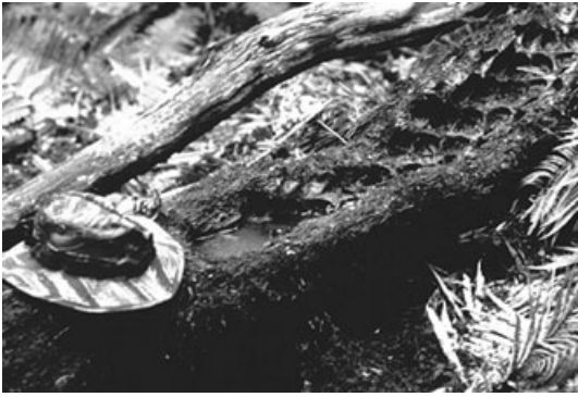
Figure 2. Tree fern ( Cibotium glaucum ) cavities are created by the feeding behavior of feral pigs in Hawaiian wet forests. In forests where surface hydrology is limited, tree fern cavities are the primary larval habitat for the mosquito vector of avian malaria, Culex quinquefasciatus .

agriculture have created nutrient-rich larval habitat. The native New Zealand mosquito, Cx. pervigilanus , prefers aquatic habitat with medium detrital loads, leaving habitat with more detritus available for introduced species like Cx. quinquefasciatus . 101 In the Galapagos, populations of Cx. quinquefasciatus are closely associated with human residence and agriculture. 102 As human populations grow and move among the five inhabited islands, Cx. quinquefasciatus populations will likely increase in distribution, abundance, and seasonal occurrence unless peridomestic sources of water are managed for mosquito control. 102, 103