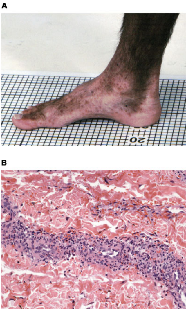
Fig. 2. A: Vasculitis on the lower leg of Patient III-3. B: Biopsy of the vasculitis from Patient III-3 demonstrating leukocytoclastic vasculitis with destruction of small vessel walls, extravasation of red cells, and infiltration of vessel walls by neutrophils, lymphocytes, eosinophils, nuclear dust and hemosiderin.

The consistent juxtaposition of several unusual immunologic and neurologic abnormalities in these siblings represents a previously undescribed syndrome. We propose to name it immunodeficiency–vasculitis–myoclonus syndrome (IVM). Affected subjects have recurrent infections, markedly elevated IgE levels, and mildly elevated levels of IgG and IgA, atopic dermatitis, cutaneous vasculitis, and non-progressive neurologic dysfunction including cortical myoclonus, peripheral neuropathy, ataxia, dysarthria with tongue weakness,