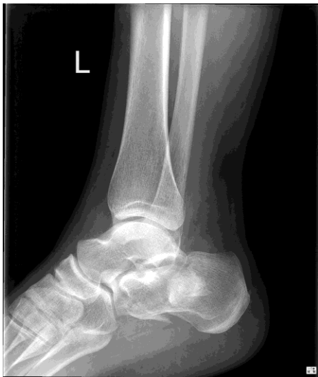
Figure 1: X- Ray lateral position

X-rays -Represents the most common and widely available diagnostic imaging technique that creates images of dense structures, like bone, so, they are particularly useful in showing fractures.