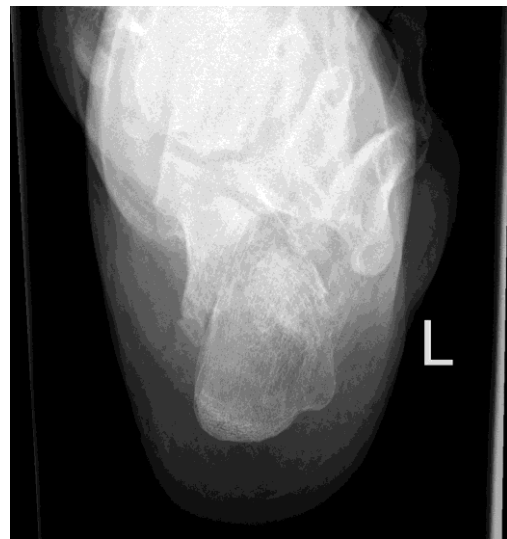
Figure 2: X-ray axial position of the calcaneus fracture

Computed tomography (CT) scan -After reviewing the X-rays, the surgeon should recommend a CT scan of the foot. This imaging tool combines X-rays with computer technology to produce a more detailed, cross-sectional image of the calcaneal body. It can provide the surgeon with valuable information about the severity of the fracture. Studying CT scans helps in planning the treatment.