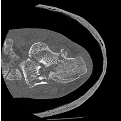
Figure 3: CT Scan