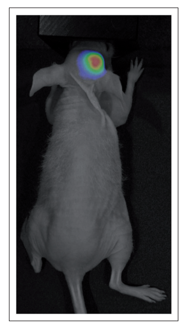
Figure 3. Fluorescent imaging of mCherry protein expression in U251 human glioma cells orthotopically injected to a mouse brain (strain: Crl:NU(NCr)-Foxn1nu/ nu). The newly formed tumour is well visualized as the image of fluorescence is superimposed on a grey-scale image of the mouse. FOBI fluorescent optical imaging system (NeoScience Co Ltd, Suwon, Korea). See Dico AL, Costa V, Martelli C, et al. MiR675-5p acts on HIF-1 \alpha to sustain hypoxic responses: a new therapeutic strategy for glioma.