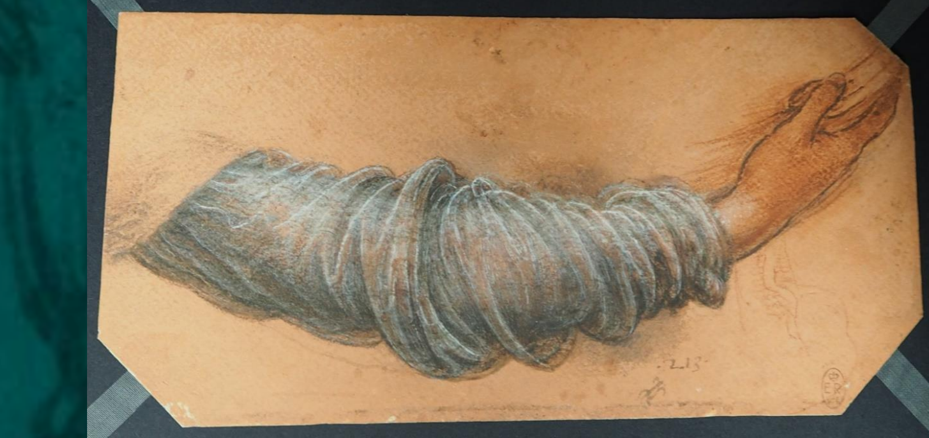
Figure 1: The arm of the Virgin © Her Majesty The Queen, Moral rights retained by Cerys Jones.

Images are captured of an object illuminated in ultraviolet, visible and infrared light. As materials interact with light in a variety of ways, features that cannot usually be seen by the human eye are suddenly revealed.