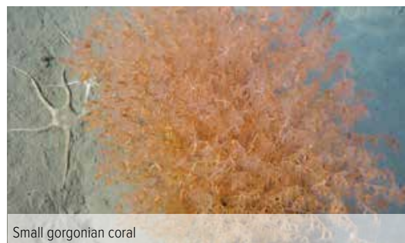
Small gorgonian coral