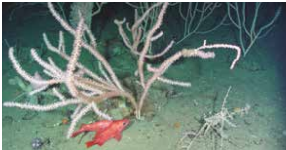
Large gorgonian coral