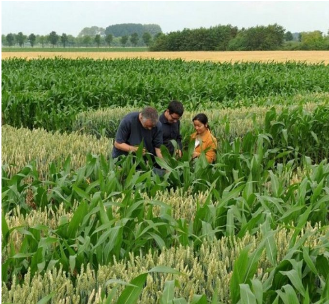
Picture: Field trial of mixed crop with wheat and maize.

DiverIMPACTS demonstrates the potential of diversification through 25 multi-actor case studies.