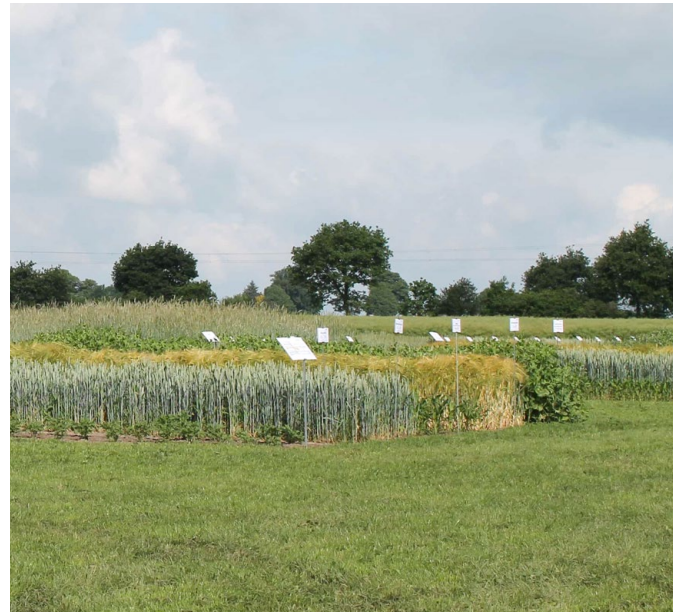
Picture: Long-term field experiment in Borwede, Germany.

DiverIMPACTS aims to quantify the performances of crop diversification using 10 existing field experiments across Europe.