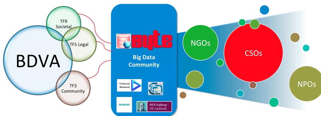
Figure 1 – the BBDC between BDVA and society

Constructive interaction between industry and society is difficult to achieve: societal organisations may be reluctant to engage with the industry, to avoid being instrumentalised; the industry may rather focus on business than on societal implications. Still, particularly in the present transition to a data-driven economy, the EU Big Data PPP, that is essentially the BDVA and the EC, should include societal actors as first-level parties. The BBDC may be the venue where this is materialized, as represented in Figure 1.