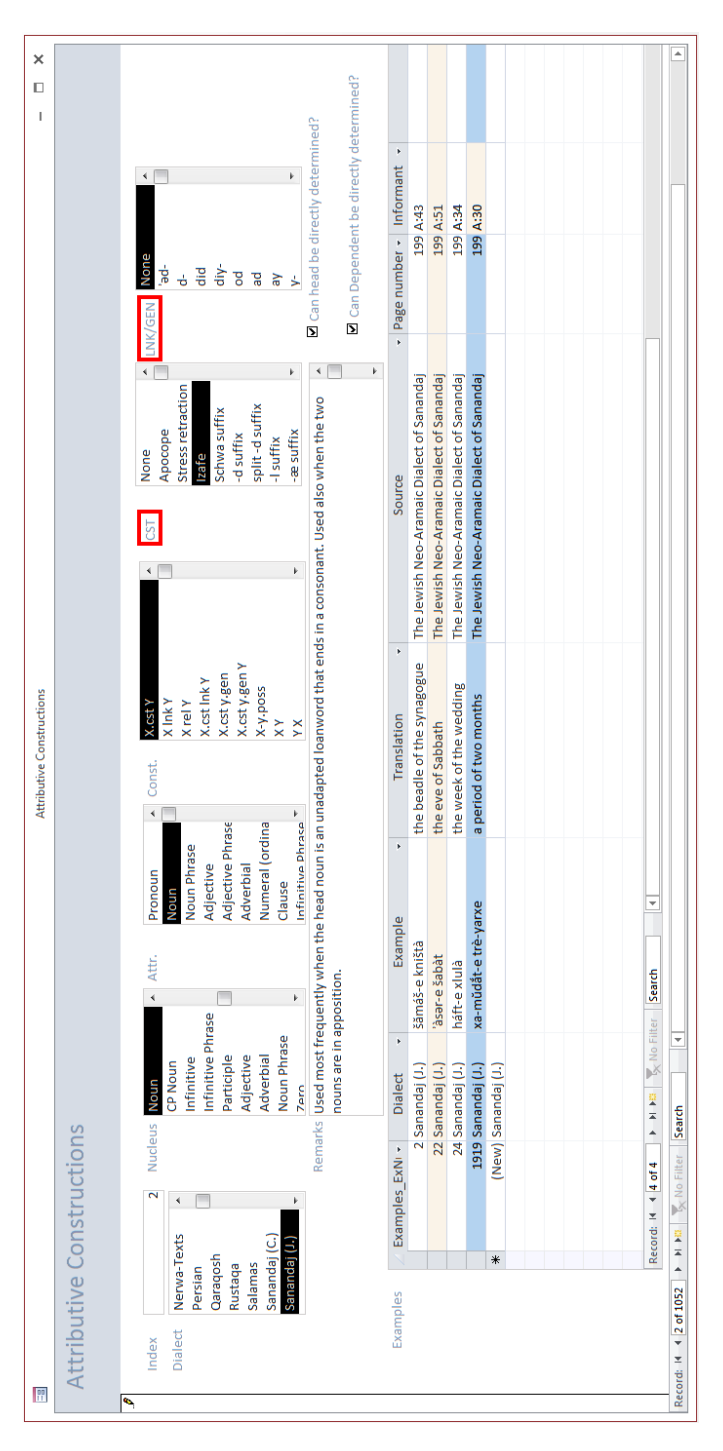
Figure 1.2: Example of data entry in the accompanying database