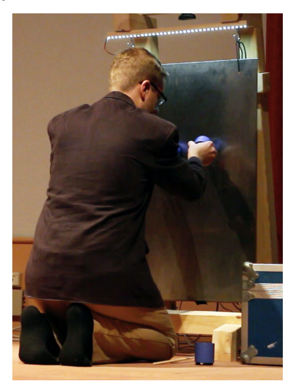
Figure 1. Metal Mirror in performance at PASIC 2014 In an attempt to extend the capabilities of the Metal Mirror,

For the current project, we were primarily interested in exploring non-robotic mechanical actuation. This was born in part out of frustration with the limitations of our first foray into actuated instruments, a device called Metal Mirror. This instrument is built from a large 2'X3' sheet of scrap steel actuated by a surface-mounted transducer and amplified with a contact microphone. The sheet of steel is suspended from a low wooden frame, putting the performer in a meditative kneeling position face-to-face with the metal (see Figure 1). The transducer is driven with sine tones generated in a Max patch that also uses a webcam to track the positions of blocks that can be magnetically attached and moved around the surface of the sheet. By moving these blocks, the performer has control over subtle adjustments to the tuning and amplitude of the sine tones. Since the scrap material was not tuned or modified outside of a few holes drilled for mounting purposes, we discovered many interesting and unexpected resonances when excited by the transducer, which led to a drone-like performance style that suits the meditative pose of the performer.