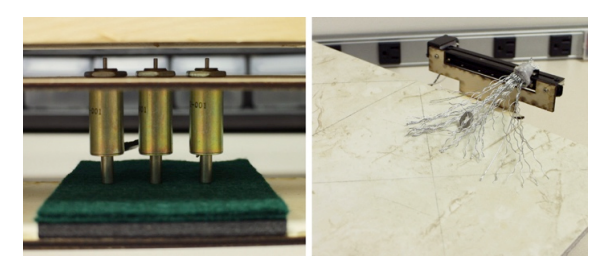
Figure 4. Mechanical actuators

a result. Adjusting the sensitivity and dynamic ranges of input and outputs affords the ability to "tune" the system in order to achieve a subjective impression of proportionality in these energetic exchanges.