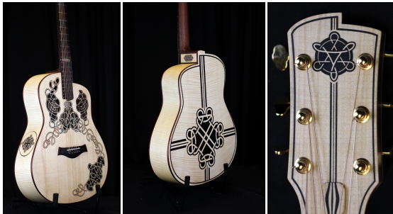
Figure 2: The finished Carolan guitar

We determined to liberally decorate Carolan with patterns (Figure 2) so as to probe diverse modes of interaction. We identified the following target locations: the headstock where the maker’s logo traditionally appears; the soundboard as the public-facing front of the guitar; the back which affords a large surface for placing a pattern that might be scanned from some distance away; the top side that is visible to those playing the guitar; the fret board where fret markers are traditionally inlaid; and a ‘secret’ code in a nook underneath a cutaway.