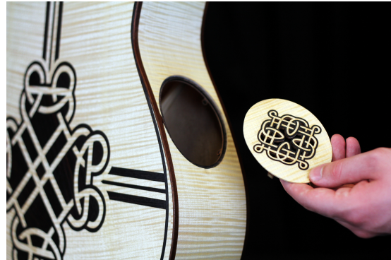
Figure 3: The removable and scannable sound-hole

repairs) we made the sound-hole on the top-side removable, being held in place by a series of small magnets (Figure 3).