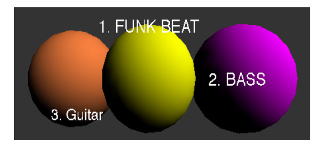
Figure 3. Graphical User Interface

The same palm position data that is scaled to MIDI values and sent to Ableton Live is also scaled to control the position of the Open GL sphere corresponding with the user-selected channel. Lateral positions of spheres are thus representative of the lateral position of their corresponding sound sources. In addition, sources that are closer to the user are seen as larger spheres, while sources that are deeper in the mix are seen as smaller spheres. Rather than simply representing panning and mix level values via a potentiometer knob and dB values from a fader, the GUI provides the user with a sense of the space being created while mixing the audio sources.