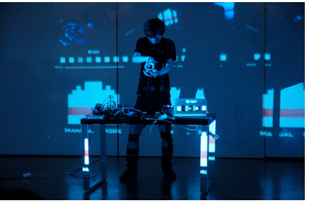
Figure 5: Performance

The authors gave ten live performances using this "B.O.M.B." at domestic and international events. In these events, the authors confirmed that our proposed wireless synchronization system worked in stable condition. It is suggested that our system demonstrate the practicality of wireless synchronization. In future, the authors will evaluate the device in terms of its stability in multi-performer musical sessions.