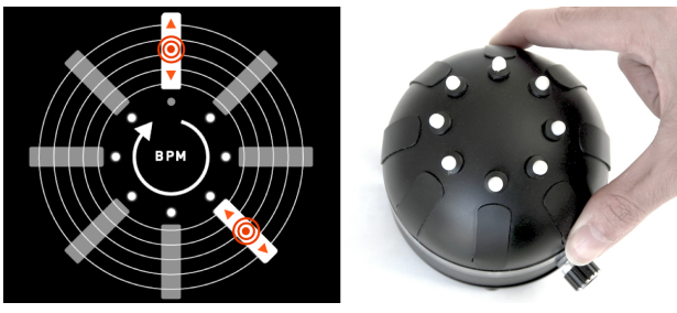
Figure 2: Interaction

As mentioned above, "B.O.M.B." allows performers to control pitches by a "grasping" interaction. Additionally, performers can change the timbre and volume by "tilting" this device (Figure 2).