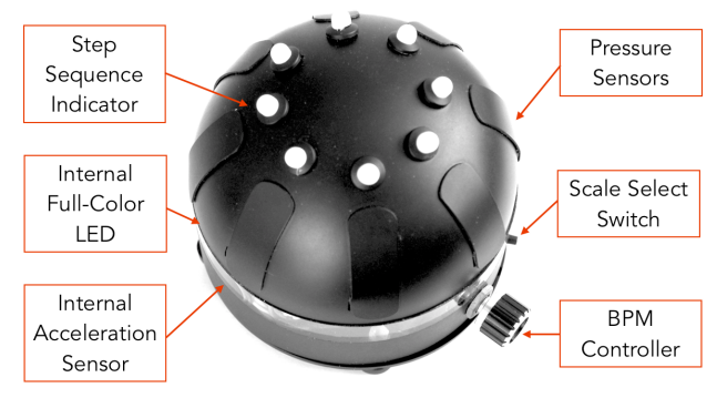
Figure 1: Hardware