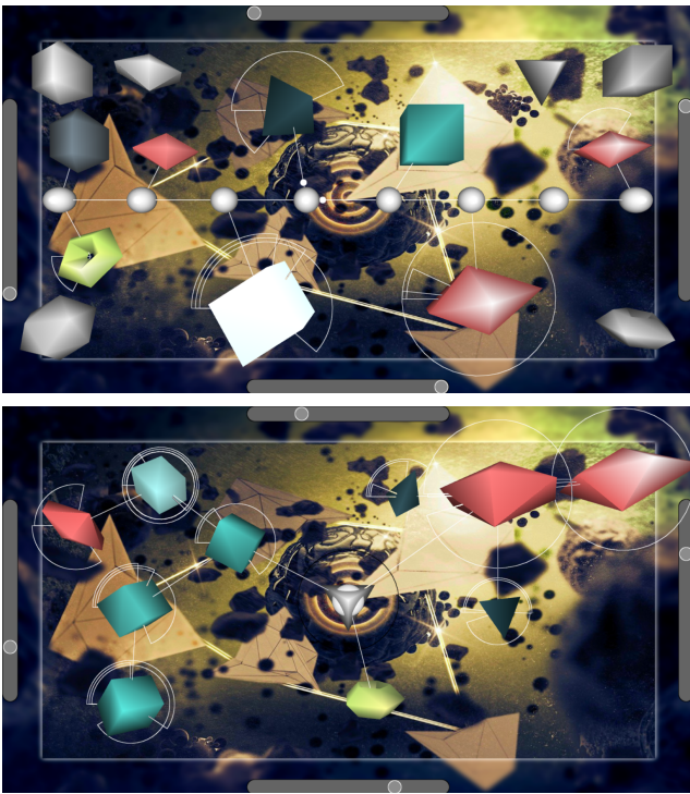
Figure 1: Screenshots of prototype 1 and 2

ing that events can happen at most at granularity of 1/8 th or 1/16 th. In this regard, a step sequencer is very limited in terms of rhythmic expressivity since only one time line exists that is fixed in length and because the musical subdivisions of a bar can only be even multiples of the duration of a step (e.g. triplets can not be used). We will make use of this core concept and successively extend it to allow for more degrees of freedom in regard to rhythmic expressivity for our prototypes.