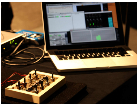
Figure 2. Performer 1's instrument.

The setup played by Performer 2 consists of a series of (percussive objects), mallets, a custom software effect for spatialisation and delay, and a wearable device to control that effect (Figure 3). The percussive objects can be grouped into two categories: wood-based, and metal/glass objects. These two groups of objects were placed on two tables, located on the sides of Performer 1's setup (Figure 4). This setup was chosen intentionally to spatially expose the sonic characteristics in relation to the performer's location on the stage. Performer 2 wore the wristwatch-like device developed in the WanderOnStage project [11]. This wireless device gives control over the sonic and spatial parameters of the performance system with arm movements. Its input is taken from microphones, which capture the sounds by playing the percussive objects. Depending on the arm position, the captured sounds are layered or fed through various delay and pitch-shift effects; and finally dynamically spread in the concert hall.