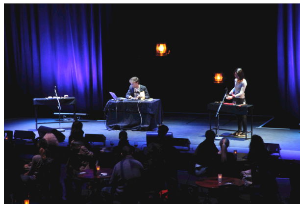
Figure 1. WOSAWIP performance at Cartes Flux 2012.

Audience engagement, however, seems to be underrepresented in concrete studies in a live electronic music performance situation with a formal evaluation method, which is why we turned our attention to the evaluation of performances, as we seek to find out more about audience's perception in this context.