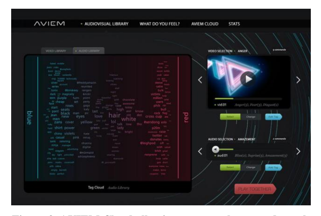
Figure 3. AVIEM Cloud allowing users to choose and watch audiovisual compositions by selecting any desired emotion.

Audiovisual Library section consists of three parts. First, the tag cloud visualization, where users can browse separately both audio and video library content according to emotion tags (Fig. 3). Second, the video selection tab, in which users choose a visual component between the videos corresponding to the emotion tag selected from video library tag cloud. In the third part, the audio selection tab works in the same manner as the video selection tab, in order to define an audio component. The important point is that users are able to sort and choose different emotions for audio and video components, which makes the final audiovisual evaluation interesting. Users may choose a visual component that addresses to "happiness" along with an audio component that is pre-tagged as "fear". Hence, the opposing nature of selected audio-visual elements is subjected to user evaluation.