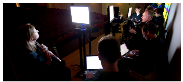
Figure 0 SGLC Rehearsal with Sonic Generator

sections, with each specifying a set of pre-composed fragments the laptop players may use and a set of operations they may use to transform them. In all sections, the laptop musicians are encouraged to borrow material created by other players. Generally speaking, the piece begins with a narrowly constrained set of unmodified long tones, then gradually allows additional pitch material and operations upon the material. Following that, the music transitions into the melodic motives, then gradually adds in transformative operations and the guided improvisations. The instrumental musicians respond to the notation, to instructions typed over the text chat, and to each other, musically interpreting the score and reacting to the graphical and textual notation to create a coherent, expressive musical performance.