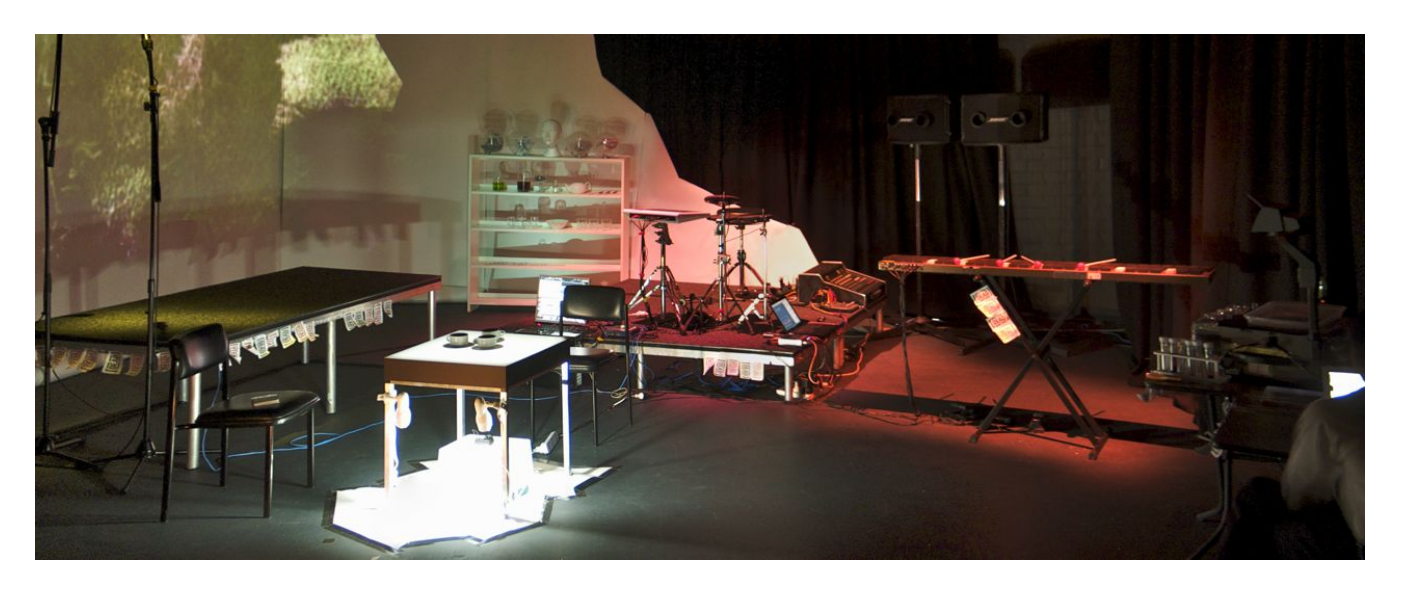
Figure 1: The set of Vital LMTD at The Street Theatre

lens purchased from Peau Productions [13]. reacTIVision sends data about the location of objects on the surface over a network using OSC [2] and TUIO [4] protocols.