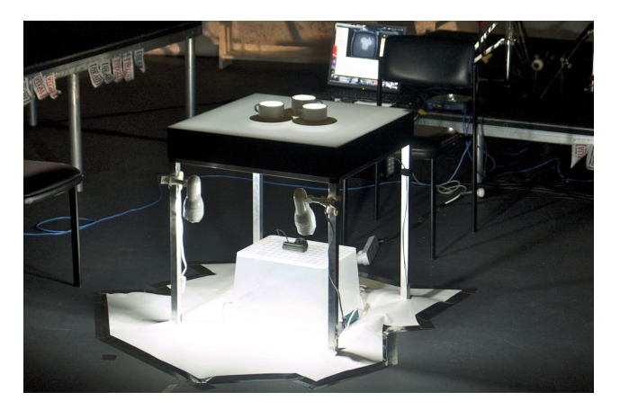
Figure 2: The computer vision surface with fiducialtagged teacups in Vital LMTD

NIME2010, June 15-18, 2010, Sydney, Australia Copyright 2010, Copyright remains with the author(s).