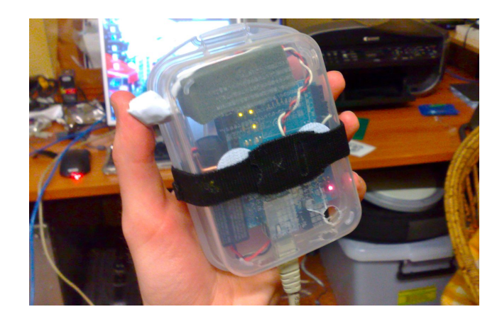
Figure 3: Our networked heartbeat sensor in action.

The Arduino is a development board for creating smart