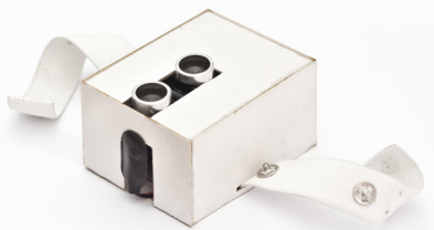
Figure 1: The Enactive Coupler (EC)

The EC is composed of one Arduino 1 controller board, one Parallax PING))) ultrasonic rangefinder sensor, two 10mm shaftless vibration motors and one plastic amplifier cube.