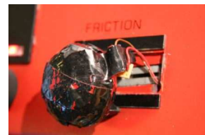
Figure 4: The rubbing excitation device is implemented with a two dimensional slider with a pressure sensitive ball on top.

In order to control the friction model an excitation device was created using two slider potentiometers and a pressure sensor, as shown in Figure 4. The device was created in order to give the user the same input capabilities as if he was rubbing his hand over a surface. The left-right motion was detected by the first slider, which was placed horizontally on the device. The pressure sensor located on top of the device detected the pressure applied to the surface. Finally, in order to simulate the capability of rubbing on different areas of the surface, the second slider was placed vertically on the device. The three sensors were used to control the velocity, bow position and force inputs of the friction model respectively.