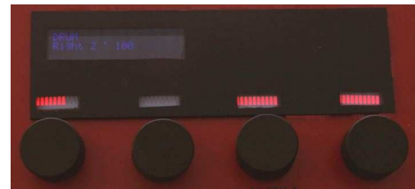
Figure 2: The control stations on the PHYSMISM allows the user to see which parameters and models he is controlling.