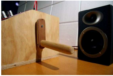
Figure 5: The crank implemented for exciting the stochastic model is attached to a dynamo.