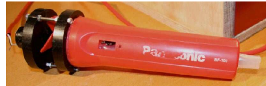
Figure 3: The blowing excitation device is created using a fan attached to a dynamo for measuring the amount of wind blown.