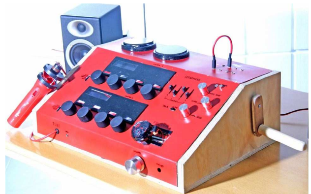
Figure 1: The final look and feel of the PHYSMISM was among other things inspired by old analogue synthesizers.