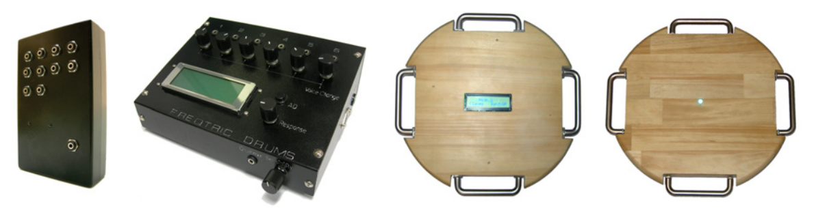
Figure 2: Prototypes of Freqtric Drums. FDL, FDL2, FDH and FDH2