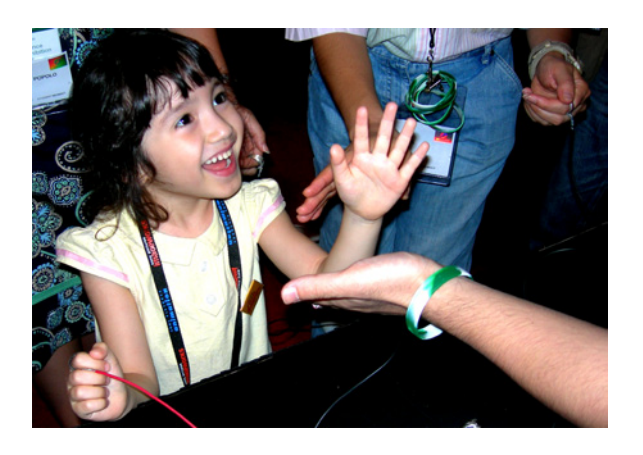
Figure 1: A child playing the Freqtric Drums.

NIME07, June 7-9, 2007, New York, NY Copyright 2007 Copyright remains with the author(s).