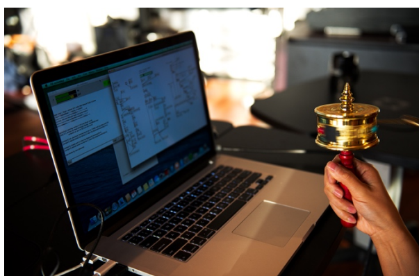
Figure 1. A Tibetan Singing Prayer Wheel interface

instruments and activities. Our previous work evaluated the TSPW's latency, reliability, reproducibility, and hardware optimization. In this work, we design and test a methodology for evaluating TSPW's perceived musical expressiveness from the audience's perspective, with the primary goal of validating the mapping design and control strategies for the TSPW's real-time voice processing. We frame this study within the context of evaluation of DMIs and performers gesture as it relates to sound, and make efforts to be clear about our stakeholders, evaluation goals, criteria, methodology, and duration, as suggested in a recent survey of NIME papers [2].