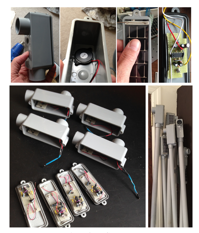
Figure 3. PVC Peepers

Before designing the first CMOS circuit, I first designed the sounding materials (the transducer and its housing). I knew that I would want to create several of these and scatter them around the lawn, so after trying several different ideas, I finally settled on a junction box for PVC conduit, which had a <sup>3</sup>/<sub>4</sub>" coupling 90 degrees outwards, which could be mounted on 1" PVC pipe. The coupling was a perfect fit for a 42 mm diameter piezo buzzer which, when mounted inside, created a wonderfully bright sound at the buzzer's resonant frequency of 3500 Hz. (thus the name Coronium 3500 ). This made the voice easy to scale with relatively inexpensive PVC electrical products, easily obtainable at hardware stores or in reuse centers (see Figure 3).