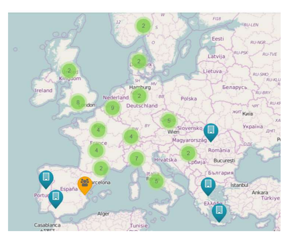
Figure 2-1 Snapshot of the first release of the map (blue for organisations, orange for networks)

We customised the map in order to visualise the number of networks/organisations by area and, when zooming in, to get a marker for the location for each of them. Information about the website of the network/organisation and the thematic area of interest is then visible at each marker (Figure 2-1).