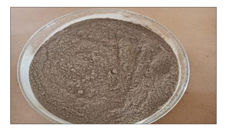
Figure No. 3: Amla Powder

Family: Euphorbiaceous Chemical Constituents: Vitamin C and Tannin, Calcium, Iron Uses: Hair growth activity <sup>[5].</sup>