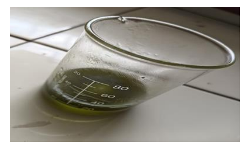
Figure No. 15:- Harsingar extract