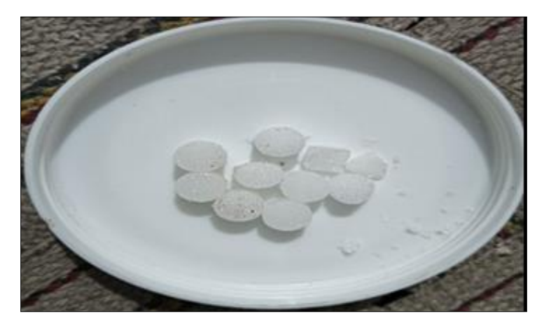
Figure No. 7:- Kapur

Uses: Pain relive and Reduce Itching <sup>[5]</sup>.