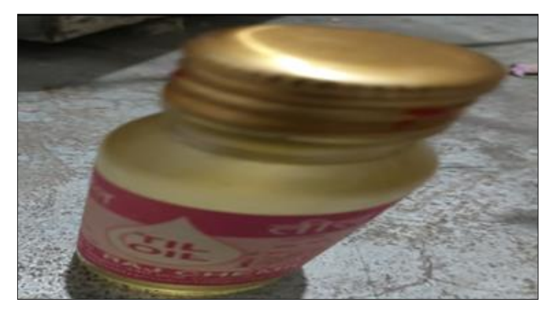
Figure No. 9:-Til Oil

Family: Pedaliaceae Chemical constituent: Lipid-45-60% Fixed oil, Vitamin A and E. Uses: Nutritive, hair growth and maintain scalp health [5]