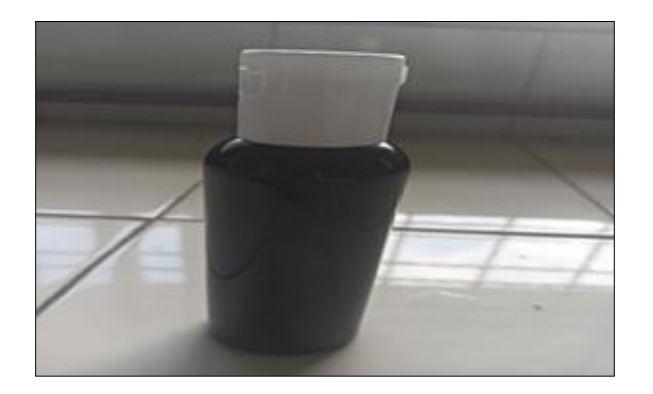
Figure No. 20:- Formulated oil