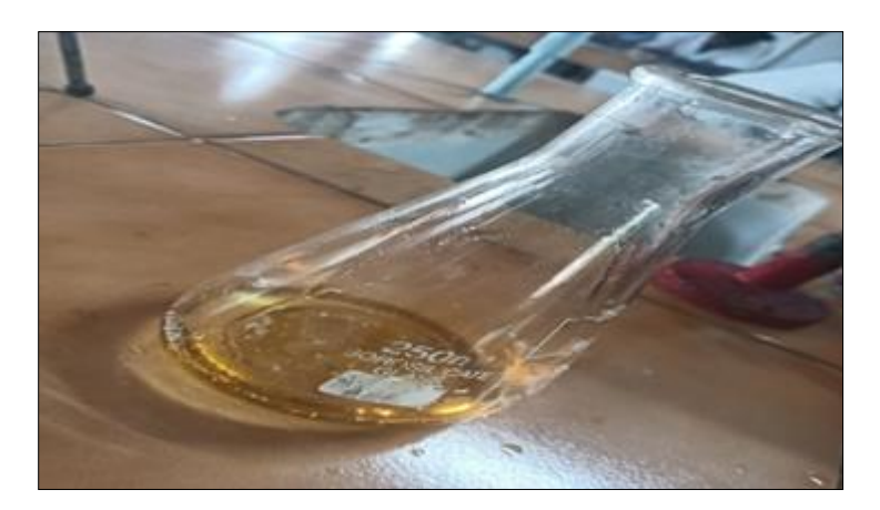
Figure No. 12:- Castor oil