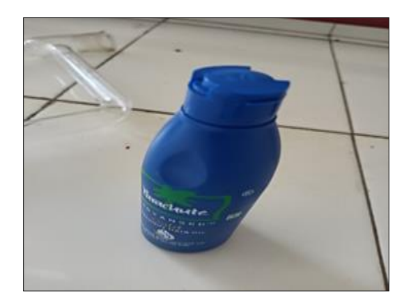
Figure No. 11:- Coconut oil

capric acid, lauric acid, myristic acid, palmitic acid, stearic acid and 2% of Linoleic acid. Uses: In addition to being good for your scalp, coconut oil also moisturizes your hair, since it's easily absorbed; it works better than other oils at repairing dry hair