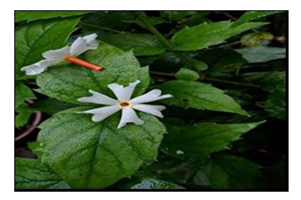
Figure No. 1: Nyctanthus arbor tristis

tropical regions of the world. Though this plant usually blooms at night, it does require plenty of sunlight and it cannot survive in a frosty or cold area. It grows best in sandy sol, moist and well drained soil. It cannot grow in highly saline soil. It is usually found in some regions of South Asia and Asia. The botanical name of the Harshingar (Parijat) Oil is Nyctanthes arbor-tristis and extracted from the Leaves by the process of Steam Distillation method. The other names of Harshingar (Parijat) oil are Night-Flowering Jasmine, Parijat and Coral Jasmine. We use Amber Color Glass Bottle for storage <sup>[2][3]</sup>