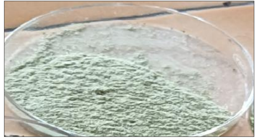
Figure No. 5:- Shankpuspi

Family: Liliaceae Chemical constituent: Shatavarin I to IV 0.2%, Sarsapojenin Uses: Nervine disorder <sup>[5].</sup>