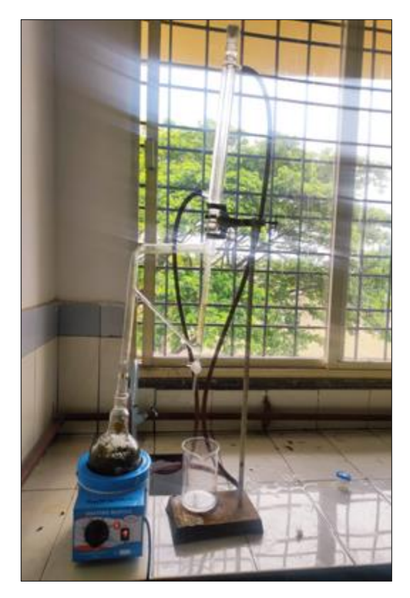
Figure No.13:-Clavenger assembly