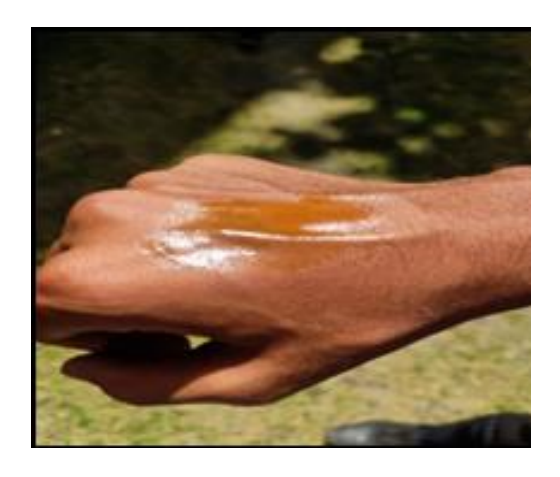
Figure No. 21:- Sensitivity test