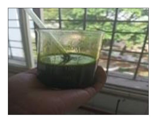
Figure No. 19:- Filtered oil