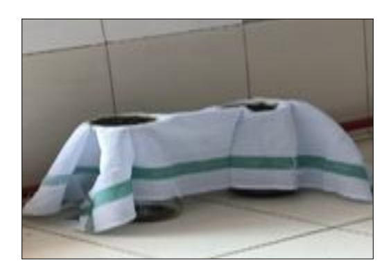
Figure No. 18:- Filtration using muslin cloth