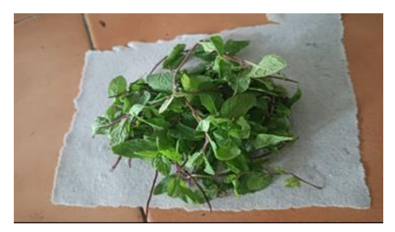
Figure No. 8: Pudina