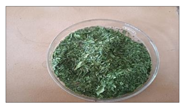
Figure No. 10:- Neem