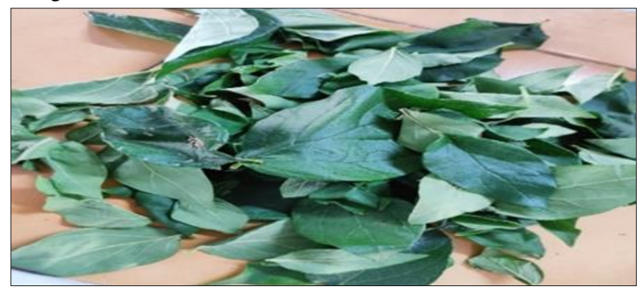
Figure No. 2:-Harsingar leaves