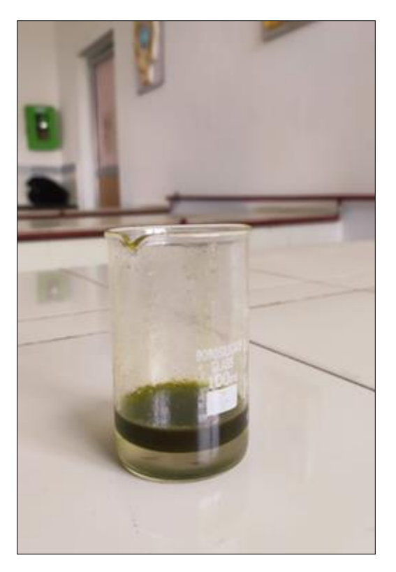
Figure No.14: Aqueous & oil extract