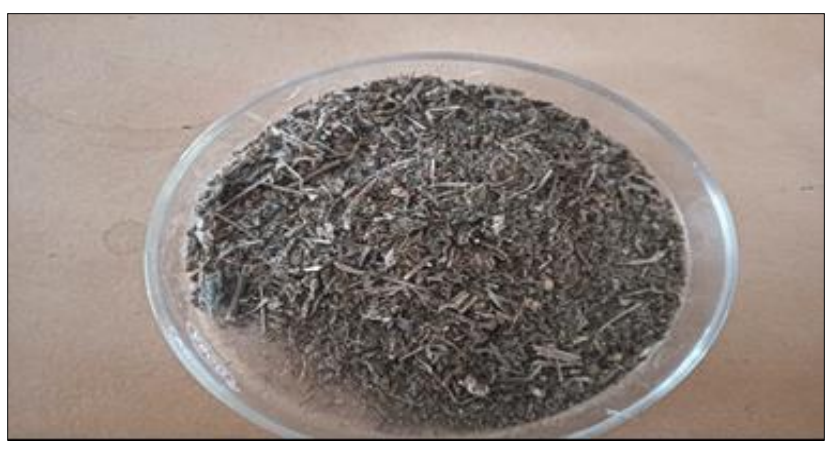
Figure No. 6: Brahmi