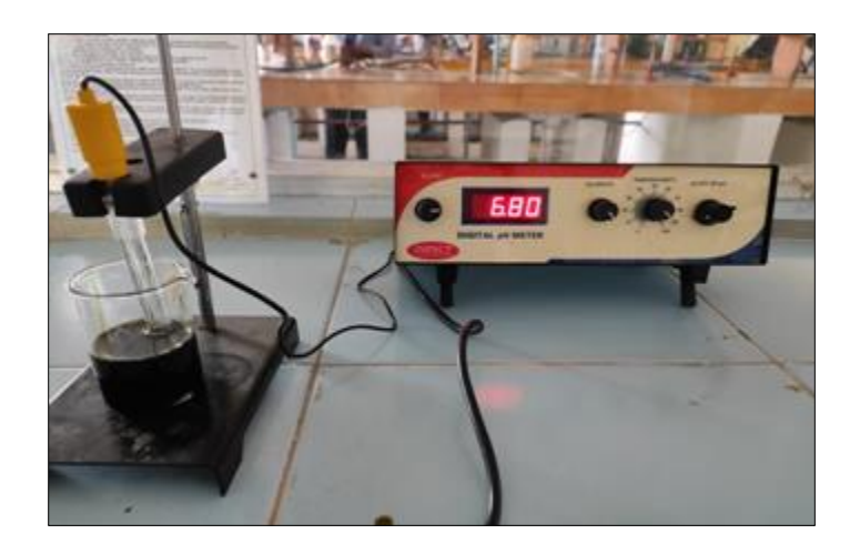
Figure No. 25:- pH meter reading