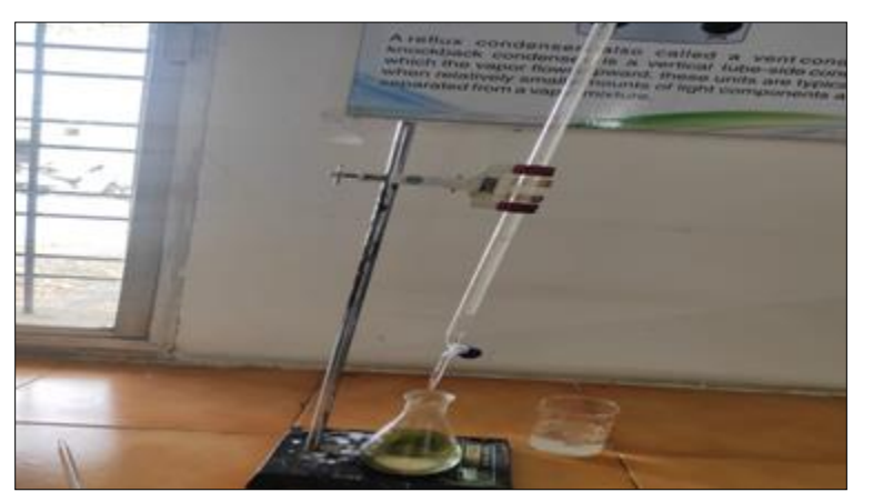
Figure No. 24:- Saponification value determination