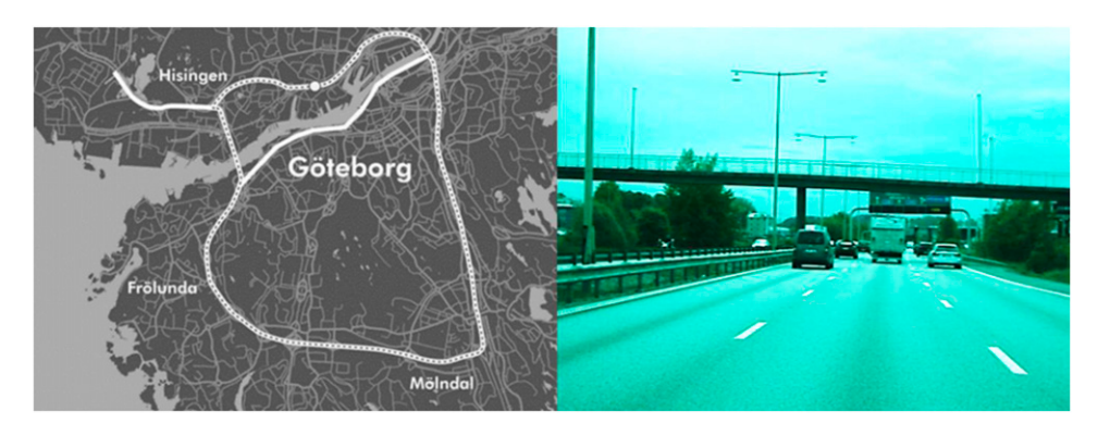
Figure 1. The public road in Gothenburg (the dashed line illustrates the stretch of road used in the study; left), with real traffic (right).