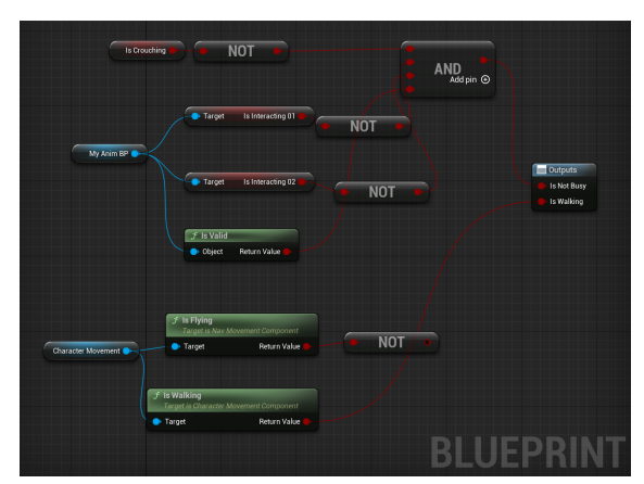
Figure 2: A blueprint example showing communication between many other blueprints, similar to object-oriented systems where references to other objects are coordinated to obtain different functionalities. In this specific case, the input comes from two different blueprints, i.e. an animation blueprint ( My AnimBlueprint ), a character movement component ( Character Movement ), and a member variable called Is Crouching . After some tests consisting of Boolean logic composed of the result of function calls (the green functions, Is Valid , Is Flying , Is Walking ,...), and by reading some member variables defined in other Blueprints ( Is Interacting 01 , Is Interacting 02 ), a final result output is obtained, which decides for external systems whether the character is currently performing an action or not. The blueprint itself can be considered a high-level utility class/function.

tained by the test agents. For example, the work in (Zheng et al., 2019) uses DRL and evolutionary methods to optimize a set of strategies for debugging video games by training agents in two different perspectives: (a) winning the game, (b) exploring the states of the environment as much as possible. In this combination, the authors prove that for certain game genres, it is possible to obtain both state and code coverage detection. Using the same basic method, other works exploit the idea of training agents by using reward functions to punish their actions when they deviate too much from human behaviors, as shown in (Gudmundsson et al., 2018), (Tastan and Sukthankar,