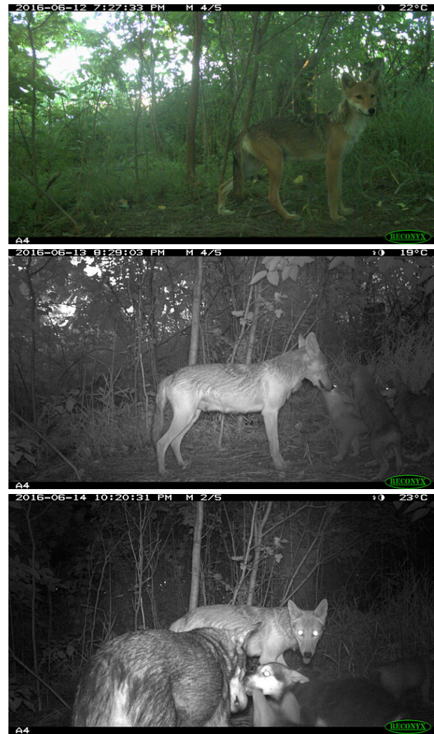
Figure 3. Example camera trap photographs showing first confirmed evidence of successful breeding of coyotes on Long Island, New York. The male and lactating female are rearing at least four pups. Researchers directly observed 8 pups and 2 adults later in the summer.

2016, Durkin 2017), although NYS Department of Environmental Conservation typically prohibits relocating “nuisance” wildlife. The situation was also complicated by perceived conflicts with feral cats (Lahmers 2016), some of the coyotes setting off perimeter alarms at the nearby prison, and Port Authority and Riker’s Island Prison Complex employees feeding coyotes in the same locations that these agencies sought to keep the coyotes out of. By the end of 2016 USDA Wildlife Services had euthanized 10 out of the 11 coyotes in this group, leaving 1 juvenile still alive in the area. The carcasses were accessioned permanently at the American Museum of Natural History (specimen vouchers AMNH 279593 to 279602).