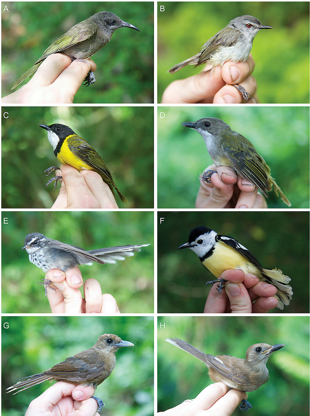
Figure 3. Photos of birds mistnetted during our survey of Vanuatu: A. Dark-brown Honeyeater Lichmera incana . B. Fan-tailed Gerygone Gerygone flavolateralis . C. Vanuatu Whistler Pachycephala chlorura (male). D. Vanuatu Whistler Pachycephala chlorura (female). E. Streaked Fantail Rhipidura verreauxi . F. Buff-bellied Monarch Neolalage banksiana . G. Southern Shrikebill Clytorhynchus pacycephaloides (adult). H. Southern Shrikebill Clytorhynchus pacycephaloides (immature).