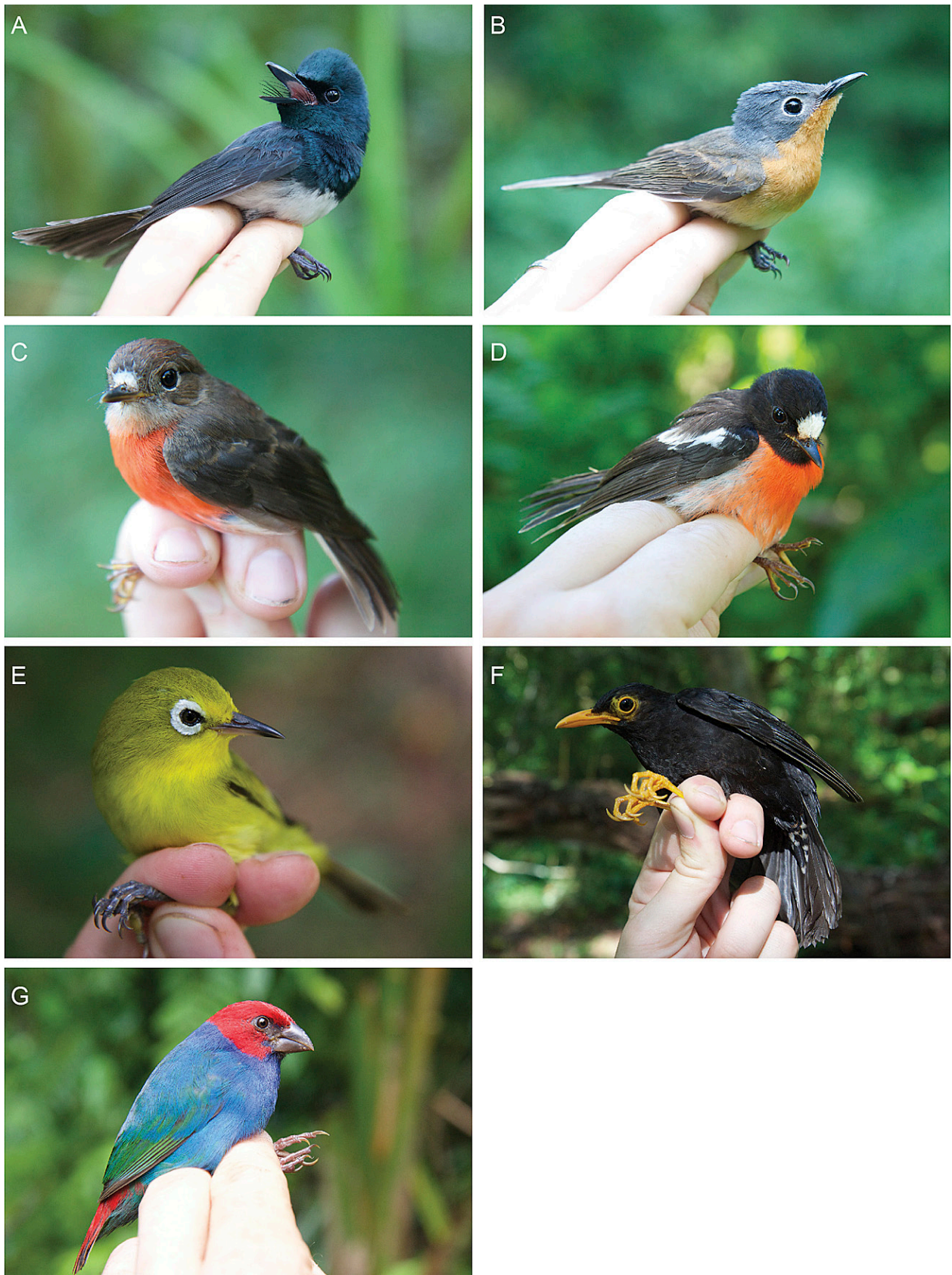
Figure 4. Photos of birds mistnetted during our survey of Vanuatu: A. Melanesian Flycatcher Myiagra caledonica (male). B. Melanesian Flycatcher Myiagra caledonica (female). C. Pacific Robin Petroica multicolor feminina . D. Pacific Robin Petroica multicolor ambrynsensis . E. Yellow-fronted White-eye Zosterops flavifrons . F. Island Thrush Turdus poliocephalus efatensis . G Royal Parrotfinch Erythrura regia .