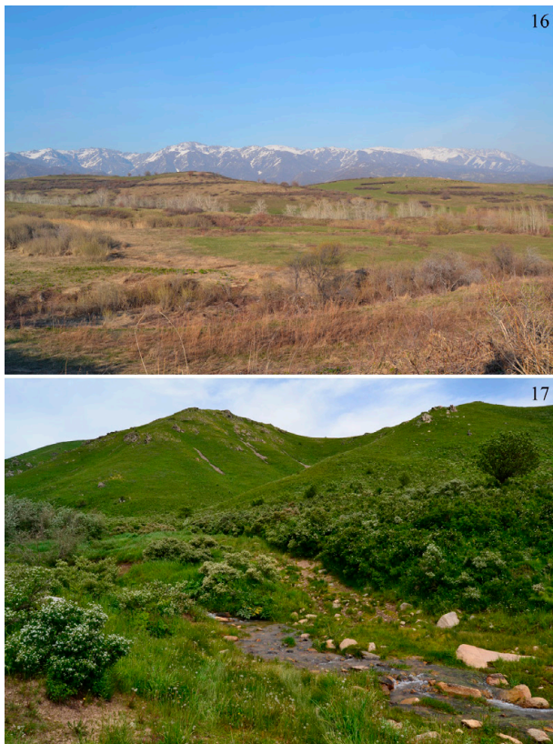
Figures 16, 17. East Kazakhstan, Tarbagatai Mountains, habitats of Shargacucullia spp. 16. 1 km N of Kyzymbet (Aleksievka) village, 47°15'47" N, 081°32.42" E, 960 m, 20 April 2014, the habitat of Sh. verbasci . 17. 6.7 km N of Kyzymbet (Aleksievka) village, 47°18'21.9" N, 081°32'9.1" E, 1300 m, 9 June 2013, the habitat of Sh. xylophana .

Urdzhar district, W Tarbagatai Mts, 9.5 km ENE of Tasaryk village, 705 m, 47°08'04.6" N, 081°24'51.0" E, bottom of rocky slope, Volynkin A.V. & Titov S.V. leg., genital slide AV1464m Volynkin, deposited in SZMN, catalogue number: SZMN-Shargacucullia-003.