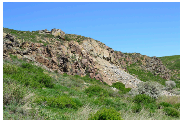
Figure 18. East Kazakhstan, Tarbagatai Mountains, 9.5 km ENE of Tasaryk village, 705 m. 47°08'04.6" N, 081°24'51.0" E, 1 May 2015, the habitat of Sh. nekrasovi and Sh. verbasci .

The identification of the specimen from the Tarbagatai Ridge was confirmed using the original description by Ronkay et al. (2011). The genitalia of a specimen from the Tarbagatai Ridge correspond well to those of the holotype illustrated by Ronkay et al. (2011). The species can be distinguished from sympatric S. verbasci by its slightly paler forewing costa and darker hindwings, and S. xylophana differs by its darker forewing costa and dark brown wings ground colour. From specimens of S. verbasci in poor condition, Sh. nekrasovi can be distinguished only by studying the genital structures. In the male genitalia, S. nekrasovi differs from S. verbasci by its longer uncus, longer valva with much broader cucullus, narrower harpe, and longer and broader cornuti in vesica, and from S. xylophana by its slightly longer uncus, slightly broader cucullus, slightly larger harpe, and much longer and broader cornuti in vesica. In the female genitalia, S. nekrasovi differs from S. verbasci by its longer antevaginal plate, ductus bursae slightly longer and broader posteriorly, and smaller appendix bursae, and from S. xylophana by its broader and slightly shorter ductus bursae and slightly smaller appendix bursae.