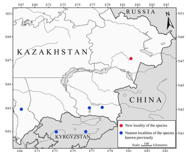
Figure 3. Map of localities of Shargacucullia nekrasovi .

The identification of the specimens from the Tarbagatai Ridge was confirmed by consulting Ronkay et al. (2011) and by comparison with specimens from southern Kazakhstan that are identical to the types illustrated by Ronkay et al. (2011). The genitalia of specimens from the Tarbagatai Ridge have no differences from those of specimens from southern Kazakhstan as well as the illustrations by Ronkay et al. (2011). This species can be distinguished from sympatric S. xylophana by its darker forewing costa and brown wings ground colour, and from sympatric S. nekrasovi differs by its slightly paler forewing costa and paler hindwings. Specimens of S. verbasci in poor condition can be distinguished from S.