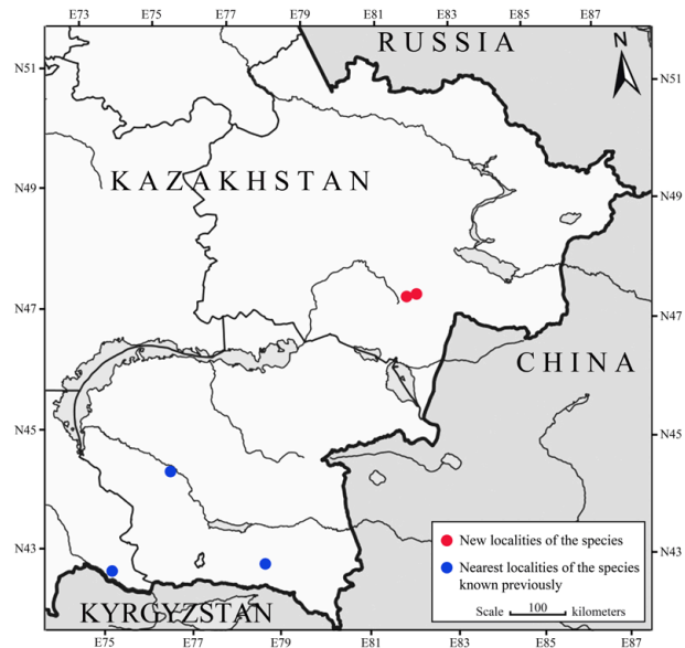
Figure 2. Map of localities of Shargacucullia verbasci .

Material examined. 2 males, 30.IV.2015, E Kazakhstan, Urdzhar district, W Tarbagatai Mts, 9.5 km ENE of Tasaryk village, 705 m, 47°08'04.6" N, 081°24'51.0" E, bottom of rocky slope, Volynkin A.V. & Titov S.V. leg., genital slides AV1471m, AV1472m Volynkin, deposited in SZMN, catalogue numbers: SZMN- Shargacucullia -001, SZMN- Shargacucullia -002; 5 males, 1