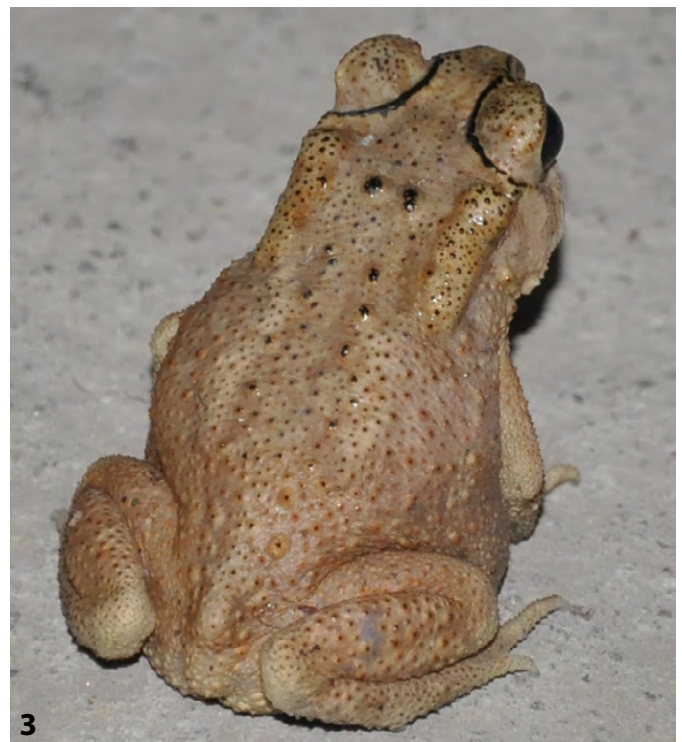
Figures 2–3. Amphibians of the Sikkim Himalaya, India. 2. Duttaphrynus himalayanus (SVL 66.5 mm, male), 27°39'34.41" N, 088°36'11.89" E, 19 June 2013. 3. Duttaphrynus melanostictus (SVL 60 mm, female), 27°28'38.90" N, 088°31'46.78" E, 20 May 2013.