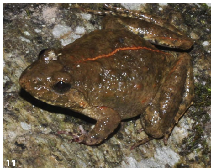
Figures 6–11. Amphibians of the Sikkim Himalaya, India. 6. Nanorana blanfordii (SVL 43 mm, male), 27°43'52.94" N, 088°33'7.99" E, 5 June 2013. 7. Nanorana gammii (SVL 72.5 mm, female), 27°24'43.42" N, 088°37'42.35" E, 22 August 12. 8. Nanorana liebigii (SVL 81.3 mm, male), 27°43'23.56" N, 088°33'7.12" E, 16 June 12. 9. Hoplobatrachus tigerinus (SVL 83.5 mm, female), 27°12'26.51" N, 088°39'5.76" E, 11 October 2013. 10. Fejervarya nepalensis (SVL 29 mm, male), 27°19'27.28" N, 088°33'43.78" E, 6 July 2012. 11. Fejervarya teraiensis (SVL 30.2 mm, male), 27°19'28.59" N, 088°33'50.24" E, 10 July 2013.

61.5–117 mm (BOULENGER 1920; DUBOIS 1976). Specimens from Sikkim, male: 55.4–100 mm ( n = 20 ); female: 69.6–120.5 mm ( n = 12 ).