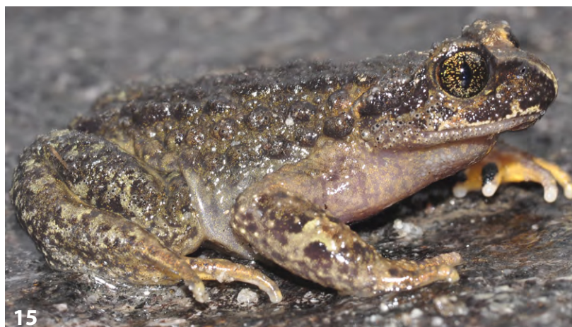
Figures 12–15. Amphibians of the Sikkim Himalaya, India. 12. Megophrys parva (SVL 39.2 mm, male), 27°22'35.92" N, 088°13'23.88" E, 19 August 2012. 13. Megophrys robusta (SVL 82.2 mm, female), 27°30'25.61" N, 088°31'18.85" E, 28 May 12. 14. Scutigera boulengeri (SVL 48.5 mm, male), 28°01'34.79" N, 088° 42'51.72" E, 7 June 2013. 15. Scutigera sikkimensis (SVL 48 mm, male), 27°43'54.75" N, 088° 33'13.42" E, 5 June 2013.

60.1–73 mm ( n = 5 ); female: 63.6–83.5 mm ( n = 7 ).