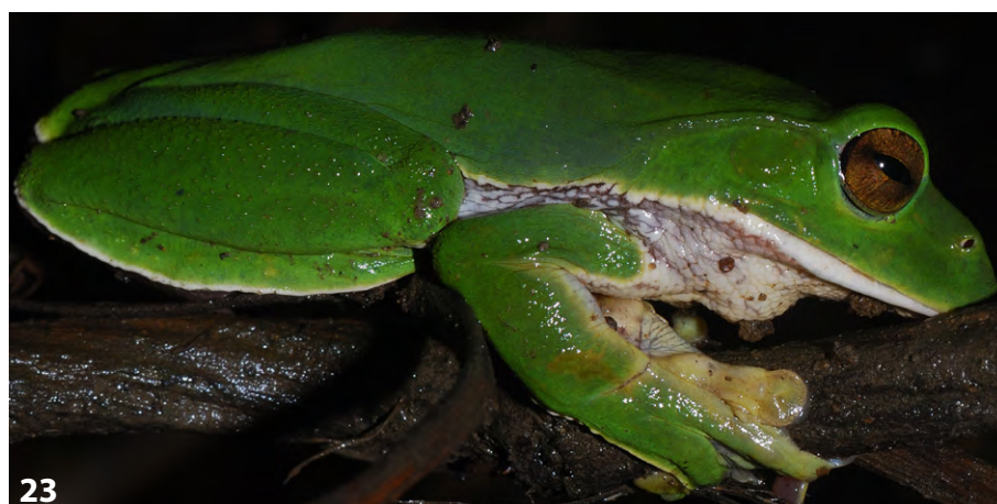
Figures 20–23. Amphibians of the Sikkim Himalaya, India. 20. Polypedates leucomystax (SVL 52.5 mm, male), 27°14'59.70" N, 088°11'18.75" E, 10 August 2013. 21. Polypedates maculatus (SVL 55.9 mm, male), 27°32'57.79" N, 088°27'24.57" E, 6 May 2012. 22. Raorchestes annandalii (SVL 18.2 mm, male), 27°20'17.44" N, 088°36'42.28" E, 1 May 2012. 23. Rhacophorus maximus (SVL 99.5 mm, female), 27°09'44.58" N, 088°09'54.10" E, 6 April 2012.

Venter slightly granular and white or yellowish.