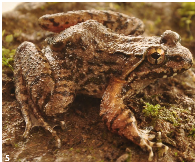
Figures 4–5. Amphibians of the Sikkim Himalaya, India. 4. Duttaphrynus stuartii (SVL 52 mm, male), 27°13'57.25" N, 088°10'59.60" E (SVL 52, male), 28 August 2013. 5. Nanorana annandalii (SVL 33.1 mm, male), 27°13'57.74" N, 088°11'0.42" E, 28 August 13.