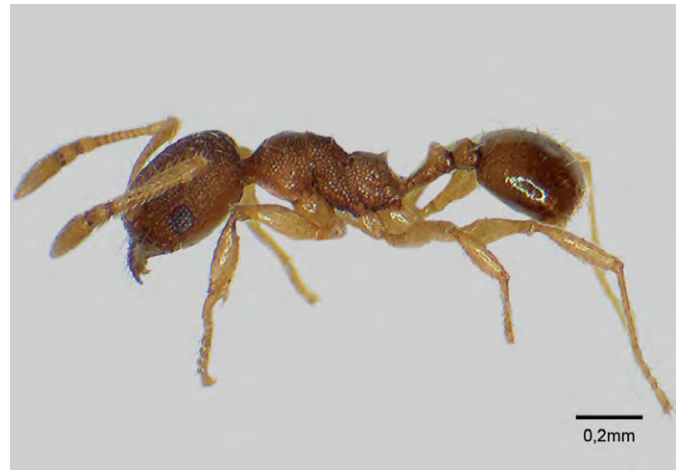
Figure A23. Subfamily Myrmicinae: Pheidole sospes .