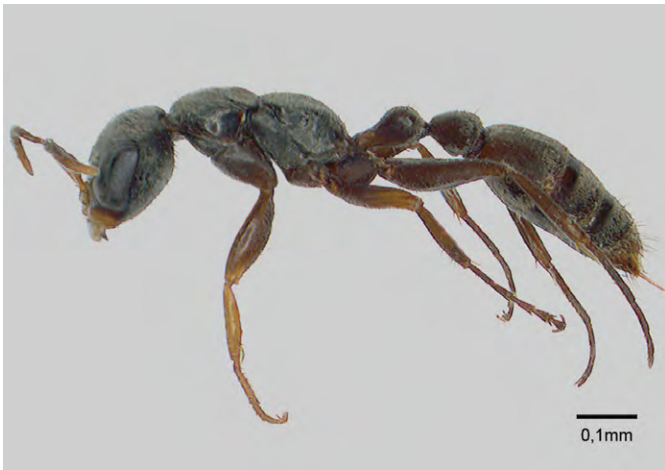
Figure A44. Subfamily Pseudomyrmecinae: Pseudomyrmex gracilis .