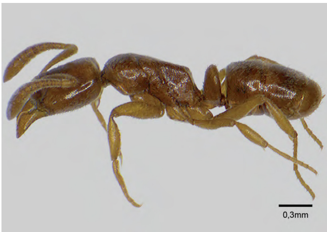
Figure A39. Subfamily Ponerinae: Hypoponera sp. 1.