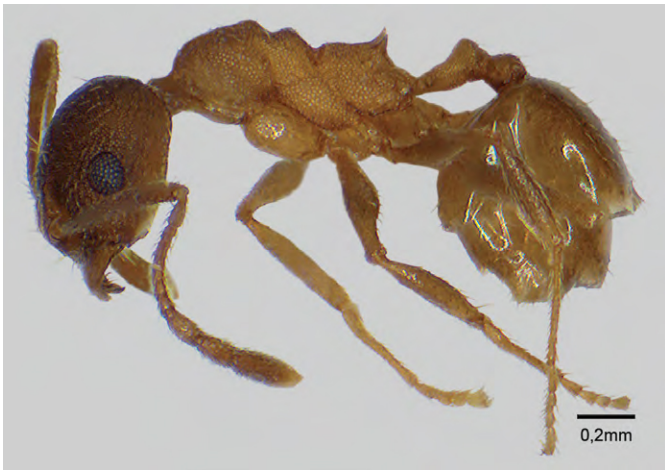
Figure A32. Subfamily Myrmicinae: Pheidole sp. 44.