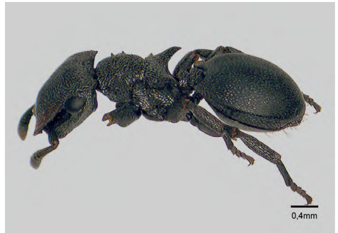
Figure A17. Subfamily Myrmicinae: Cephalotes pusillus .