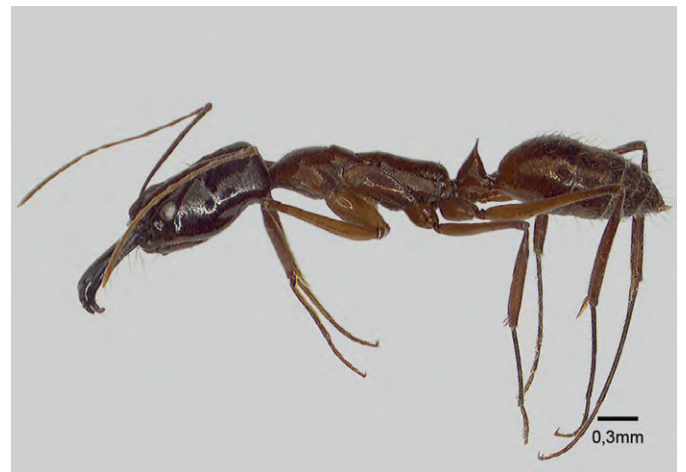
Figure A42. Subfamily Ponerinae: Odontomachus chelifer .