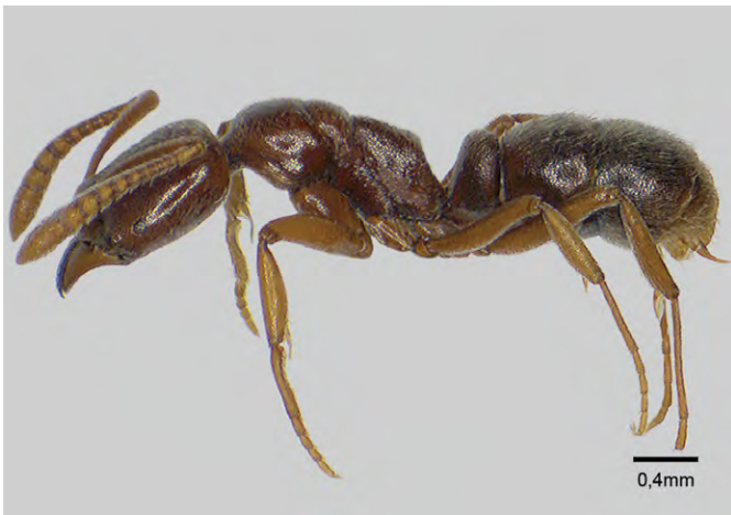
Figure A40. Subfamily Ponerinae: Hypoponera sp. 11.