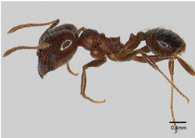
Figure A26. Subfamily Myrmicinae: Pheidole sp. 24.