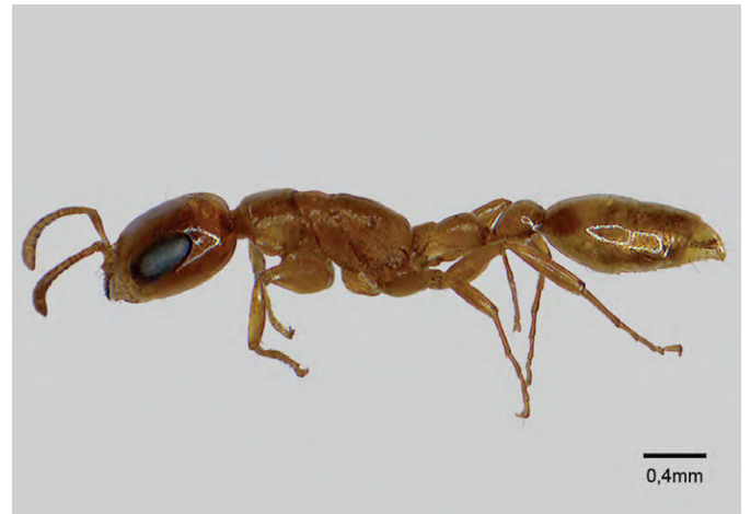
Figure A45. Subfamily Pseudomyrmecinae: Pseudomyrmex sp. 3.