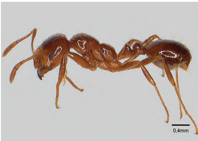
Figure A33. Subfamily Myrmicinae: Solenopsis saevissima .