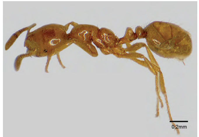
Figure A35. Subfamily Myrmicinae: Solenopsis sp. 3.