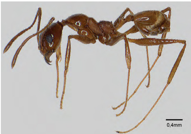
Figure A22. Subfamily Myrmicinae: Pheidole oxyops .