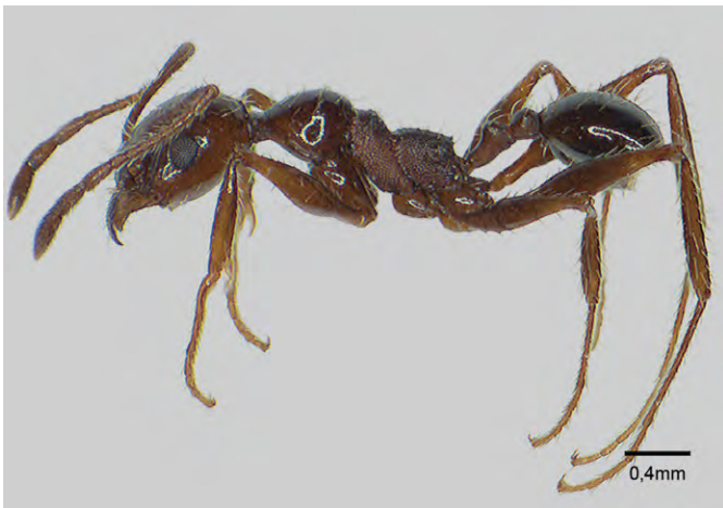
Figure A28. Subfamily Myrmicinae: Pheidole sp. 36.