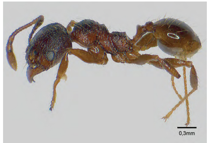
Figure A31. Subfamily Myrmicinae: Pheidole sp. 44.