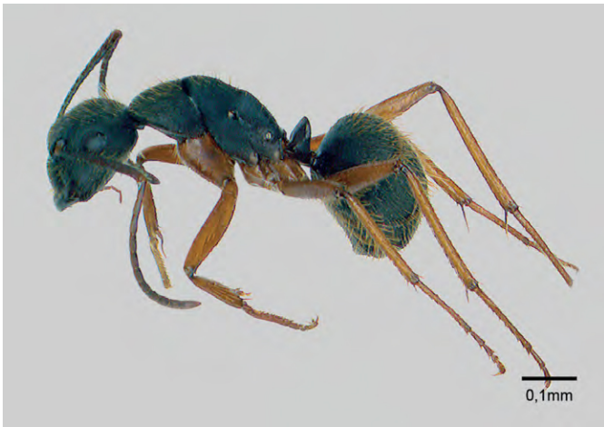
Figure A8. Subfamily Formicinae: Camponotus rufipes .