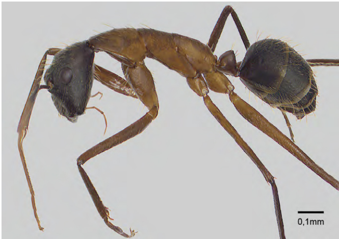
Figure A10. Subfamily Formicinae: Camponotus sp. 11.