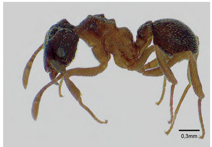
Figure A18. Subfamily Myrmicinae: Cyphomyrmex (gr rimosus) .