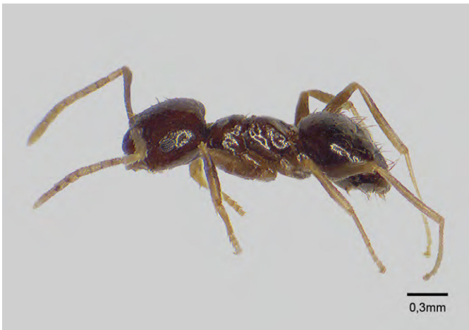
Figure A4. Subfamily Formicinae: Brachymyrmex admotus .