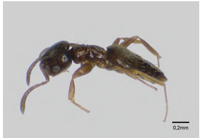
Figure A5. Subfamily Formicinae: Brachymyrmex cordemoyi