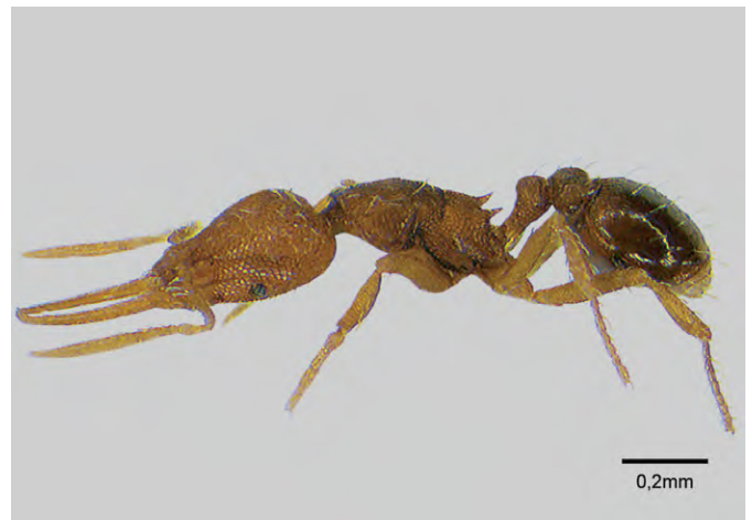
Figure A36. Subfamily Myrmicinae: Strumigenys denticulata .