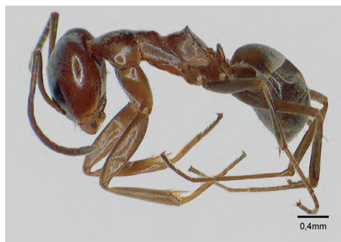
Figure A1. Subfamily Dolichoderinae: Dorymyrmex brunneus .

Photos and identification of the species collected in the parks studied. The vouchers were deposited in the ant fauna reference collection of Alto Tietê (University of Mogi das Cruzes).