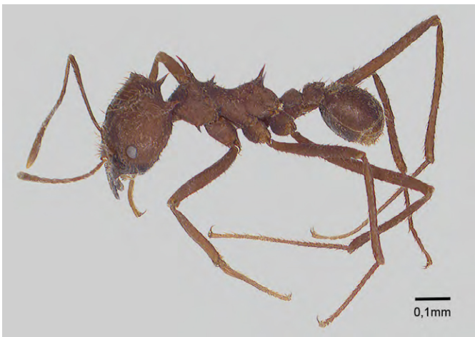
Figure A15. Subfamily Myrmicinae: Atta sexdens .