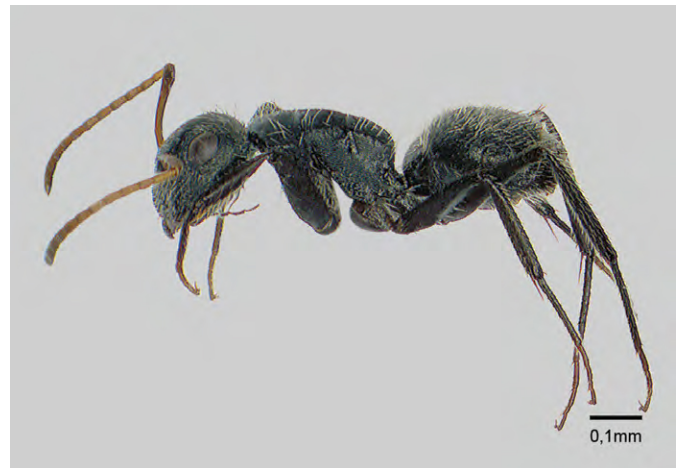
Figure A7. Subfamily Formicinae Camponotus crassus .