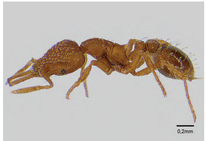
Figure A37. Subfamily Myrmicinae: Strumigenys louisianae .