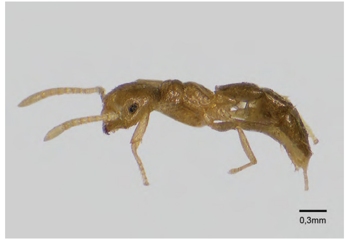
Figure A6. Subfamily Formicinae: Brachymyrmex heeri .