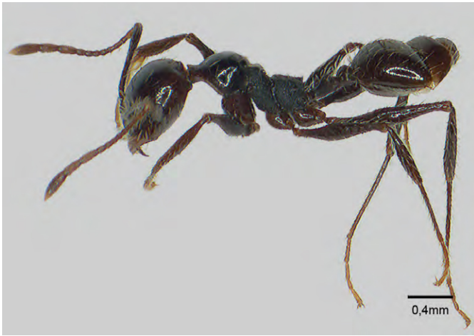
Figure A21. Subfamily Myrmicinae: Pheidole obscurithorax .