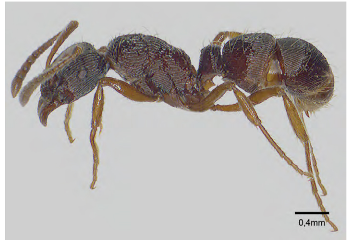
Figure A13. Subfamily Ectatomminae: Gnamptogenys striatula .