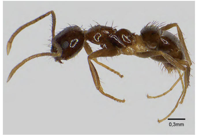
Figure A12. Subfamily Formicinae: Nylanderia sp. 1.