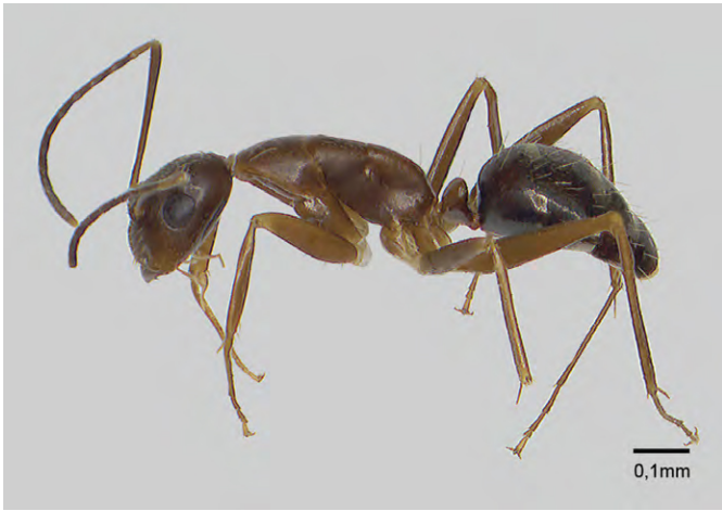
Figure A9. Subfamily Formicinae: Camponotus sp. 5.