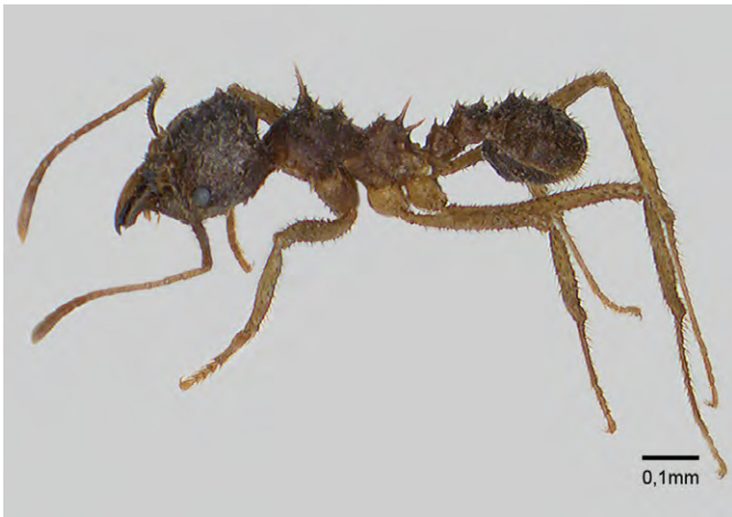
Figure A14. Subfamily Subfamily Myrmicinae: Acromyrmex niger .