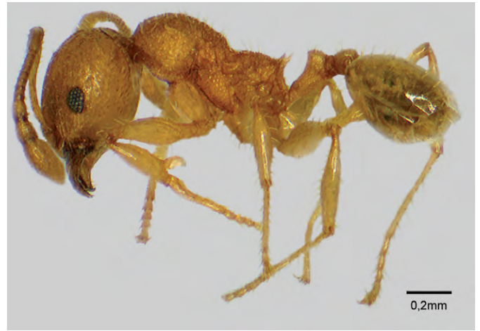
Figure A24. Subfamily Myrmicinae: Pheidole sp. 5.