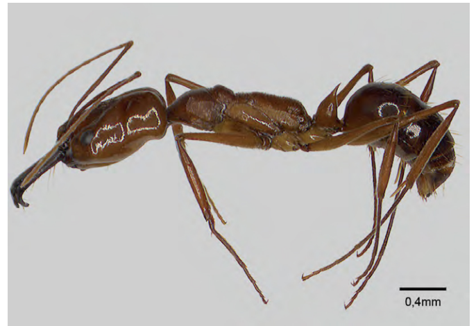
Figure A41. Subfamily Ponerinae: Odontomachus affinis .