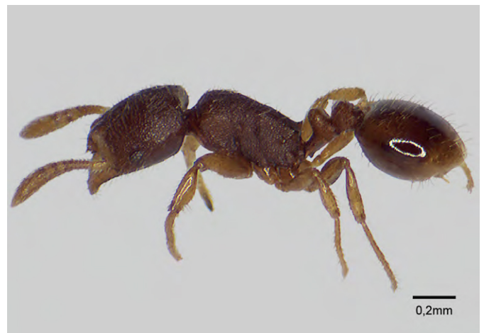
Figure A19. Subfamily Myrmicinae: Oxyepoecus myops .