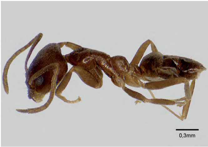
Figure A3. Subfamily Dolichoderinae: Linepithema neotropicum .