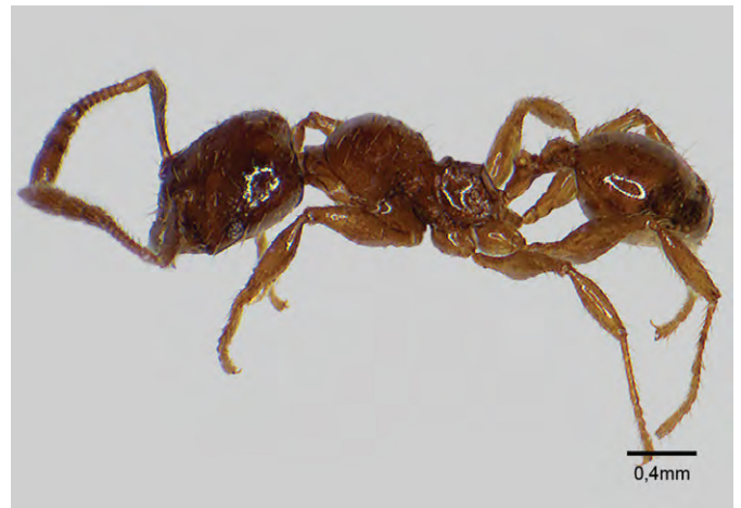
Figure A25. Subfamily Myrmicinae: Pheidole sp. 21.