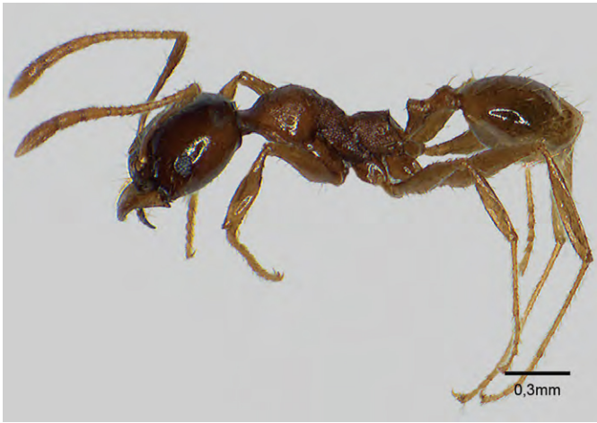
Figure A27. Subfamily Myrmicinae: Pheidole sp. 26.