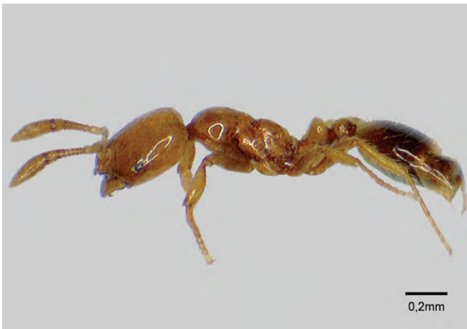
Figure A34. Subfamily Myrmicinae: Solenopsis sp. 2.