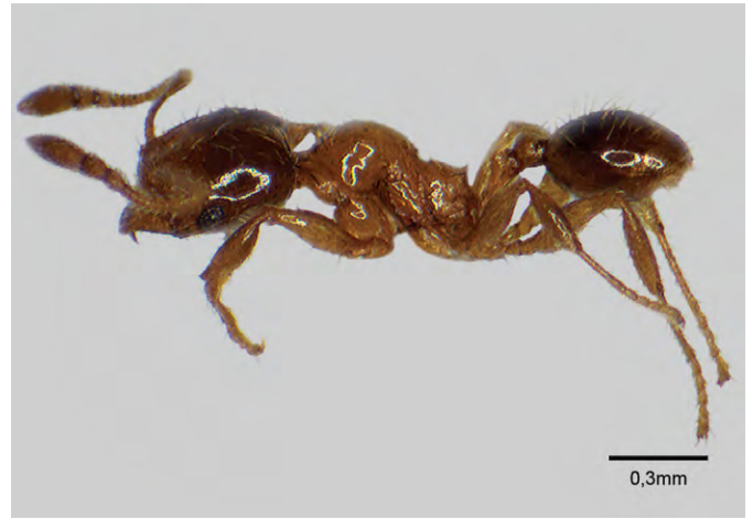
Figure A30. Subfamily Myrmicinae: Pheidole sp. 39.