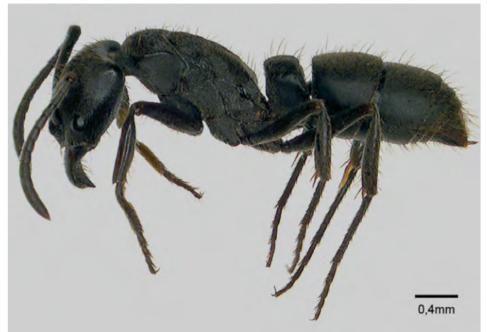
Figure A43. Subfamily Ponerinae: Pachycondyla striata .