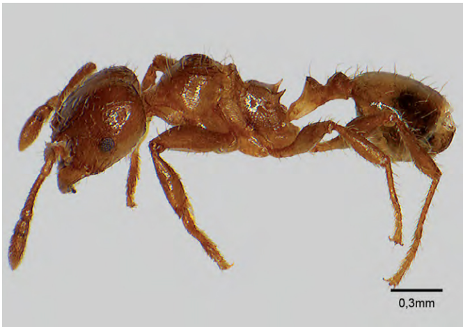
Figure A20. Subfamily Myrmicinae: Pheidole aberrans .