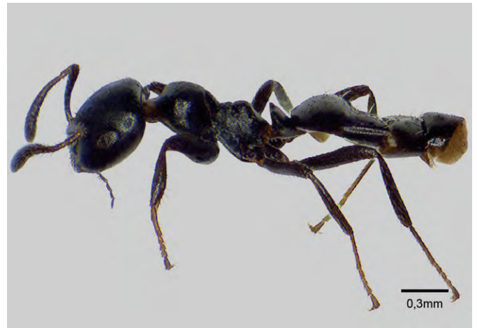
Figure A11. Subfamily Formicinae: Myrmelachista catharinae .