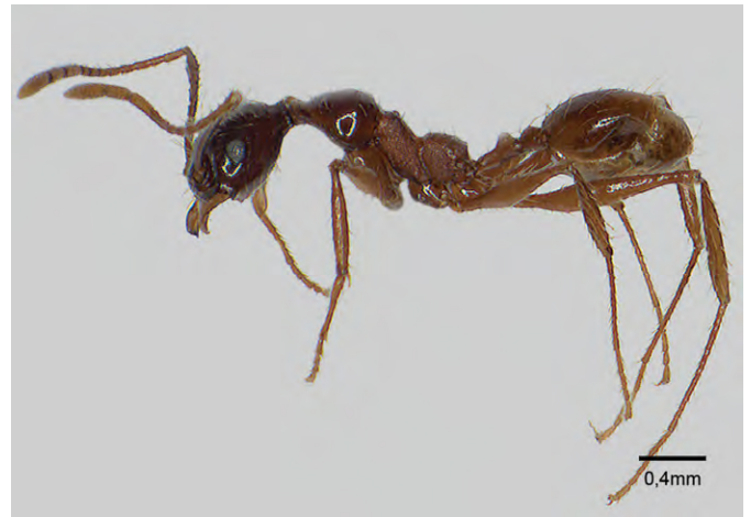
Figure A29. Subfamily Myrmicinae: Pheidole sp. 38.