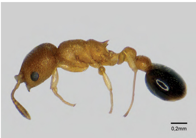
Figure A16. Subfamily Myrmicinae: Cardiocondyla wroughtonii .