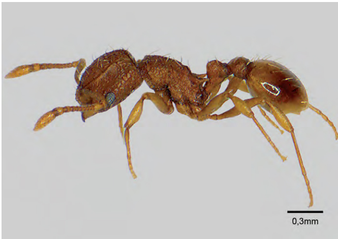
Figure A38. Subfamily Myrmicinae: Wasmannia affinis .