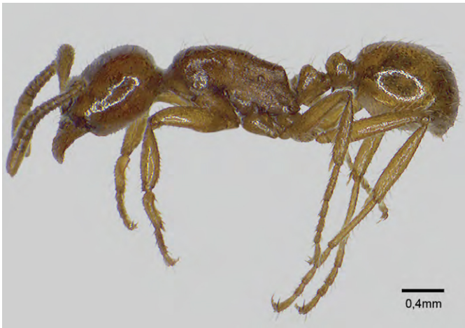
Figure A2. Subfamily Dolichoderinae: Labidus coecus .