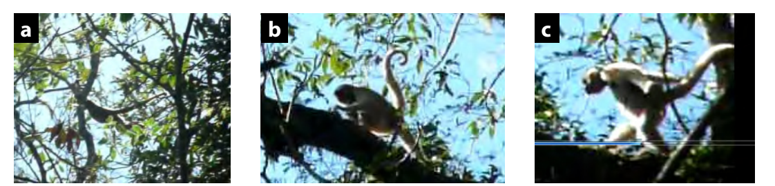
Figures 2. Video frames showing Brachyteles arachnoides at the Fazenda Olho D'Água. In these captured frames, the identifying morphological and postural characteristics are clearly seen. a) shows brachiation, protruding abdomen and long prehensile tail. b) illustrates the large body size and yellowish-brown pelage. c) shows bipedalism.

This new population of mono is approximately 37 km NE of the other known population in Paraná (Fazenda João Paulo II, Figure 1), in a ~700 ha forest fragment (Fazenda Olho d'Água). The population in Fazenda João Paulo II, found in 2002 (Koehler et al. 2002), is at least 14 years old and seems to be stable where reproduction has been observed (Koehler et al. 2005; Ingberman et al. 2009). This newly identified population at Fazenda Olho d'Água has also been recently reported to us by the local people in 2015 as still living in the fragment (Ingberman 2015). Both populations are on unprotected private lands and in isolated forest fragments. The area of these fragments is predicted to maintain the populations for at least 50 years (Jerusalinky et al. 2011), but the fragments are too small for long-term persistence