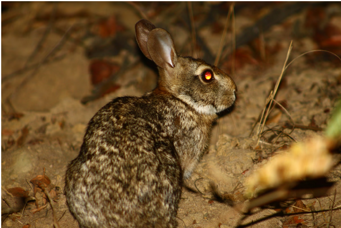
Figure 1. Sylvilagus brasiliensis recorded in João Câmara, Rio Grande do Norte state, Brazil.