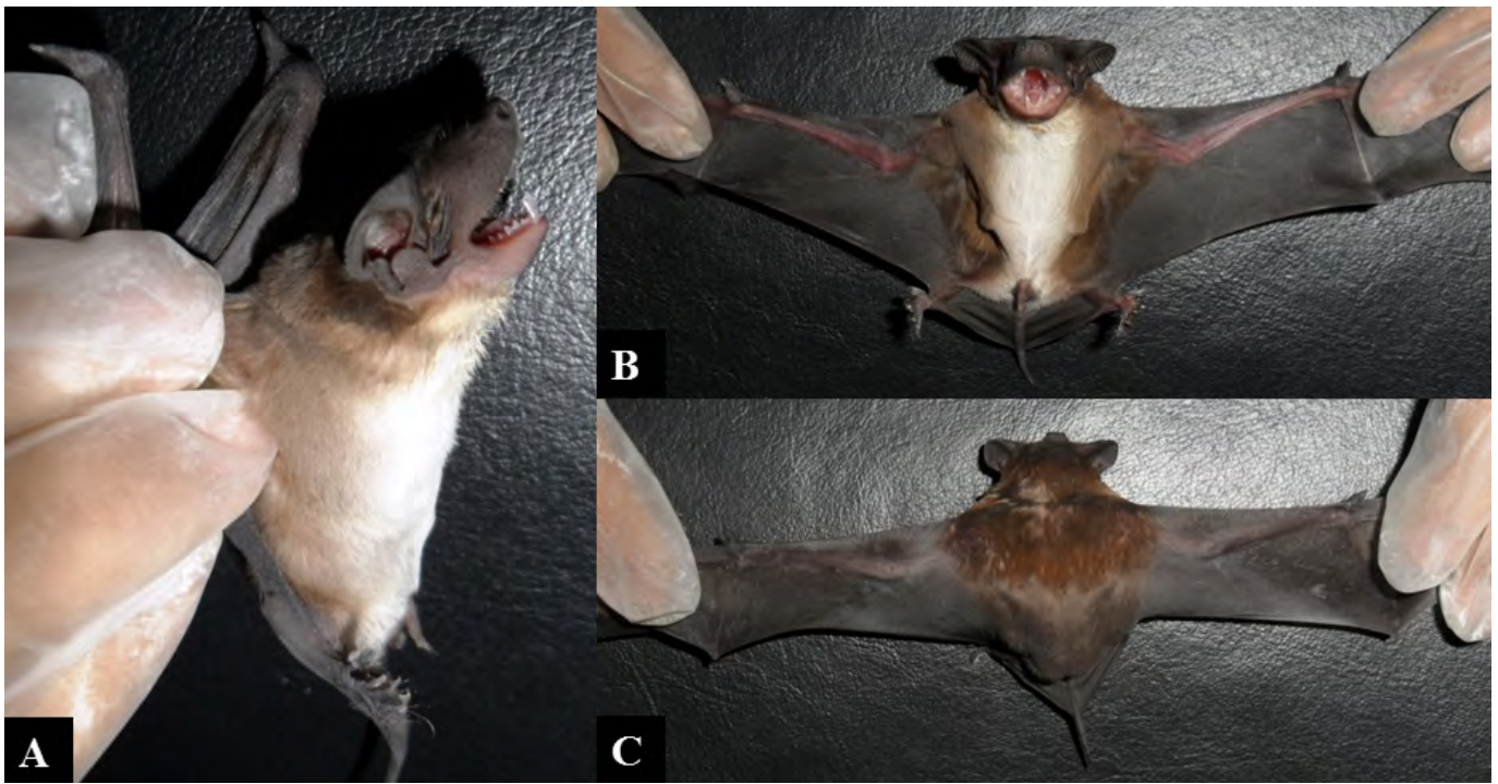
Figure 2. Specimen of Cynomops planirostris captured in Tefé, Amazonas. Lateral view (A), ventral view (B) and dorsal view (C).

Simmons and Voss (1998) and Eger (2008). Cynomops planirostris differs from its most similar congener C. paranus by its smaller overall size, smaller forearms and tail, and distinct coloration (Simmons and Voss 1998). Cynomops planirostris presents an opaque reddish-brown coloration on the dorsum, while the ventral coloration is slightly lighter, with a continuous white patch on the chest and abdomen (Figure 2) (Simmons and Voss 1998; Gregorin and Taddei 2002). Cynomops paranus has a darker, homogeneous coloration, and a bright and dark brown-gray color, with the ventral coloration showing the same patterns as the dorsal coloration, but usually greyer (Simmons and Voss 1998; Gregorin and Taddei 2002). Moreover, the collected specimen shows skull characters also compatible with C. planirostris , such as weakly developed basisphenoid pits, relatively low and short rostrum, with the anterior face of the lacrimal ridges sloping posteriorly (Eger 2008).