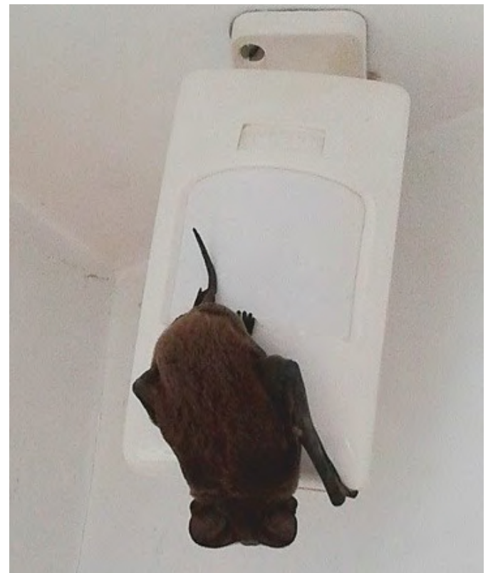
Figure 1. Adult male Tadarida brasiliensis found hanging from an alarm sensor inside a house in Puerto Deseado, southern Patagonia.

A living adult male specimen of T. brasiliensis was found on 31 March 2015 hanging from the alarm sensor inside the livingroom of a house in the city of Puerto Deseado, located on the Atlantic coast (47°45’15” S, 065°54’01” W) (Figures 1 and 2). The area belongs to the Patagonian Phytogeographical Province ( sensu León et al. 1998). It is a flat steppe of shrubs and grass interrupted by ravines, dominant tussock grass species are