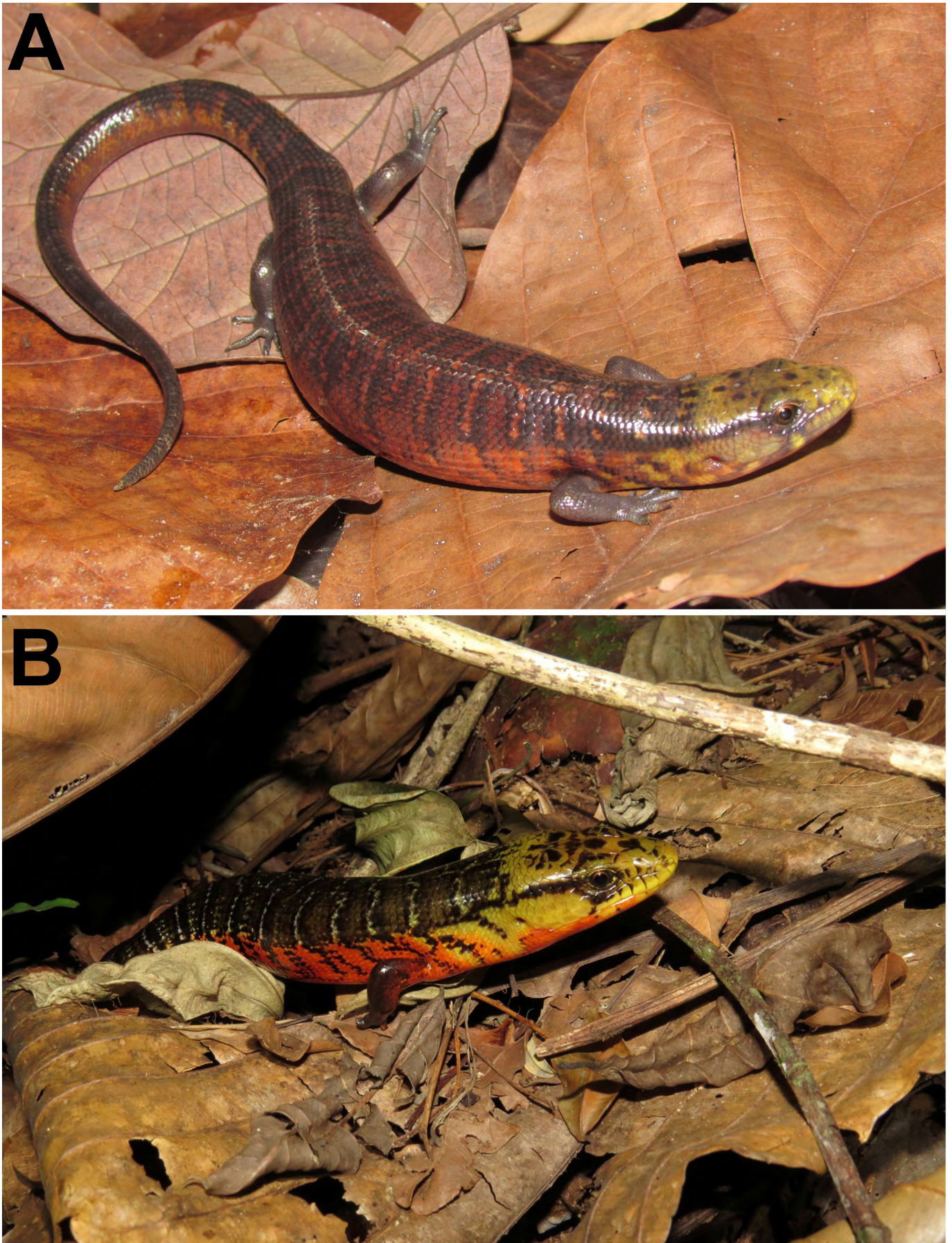
Figure 1. Diploglossus monotropis . A. Juvenile (SVL = 132.6 mm; MHUA-R 12662) from Tulenapa, Carepa (Antioquia, Colombia); B. Adult male (SVL = 155 mm; not collected) from Vereda la Campiña, Samaná (Caldas, Colombia).