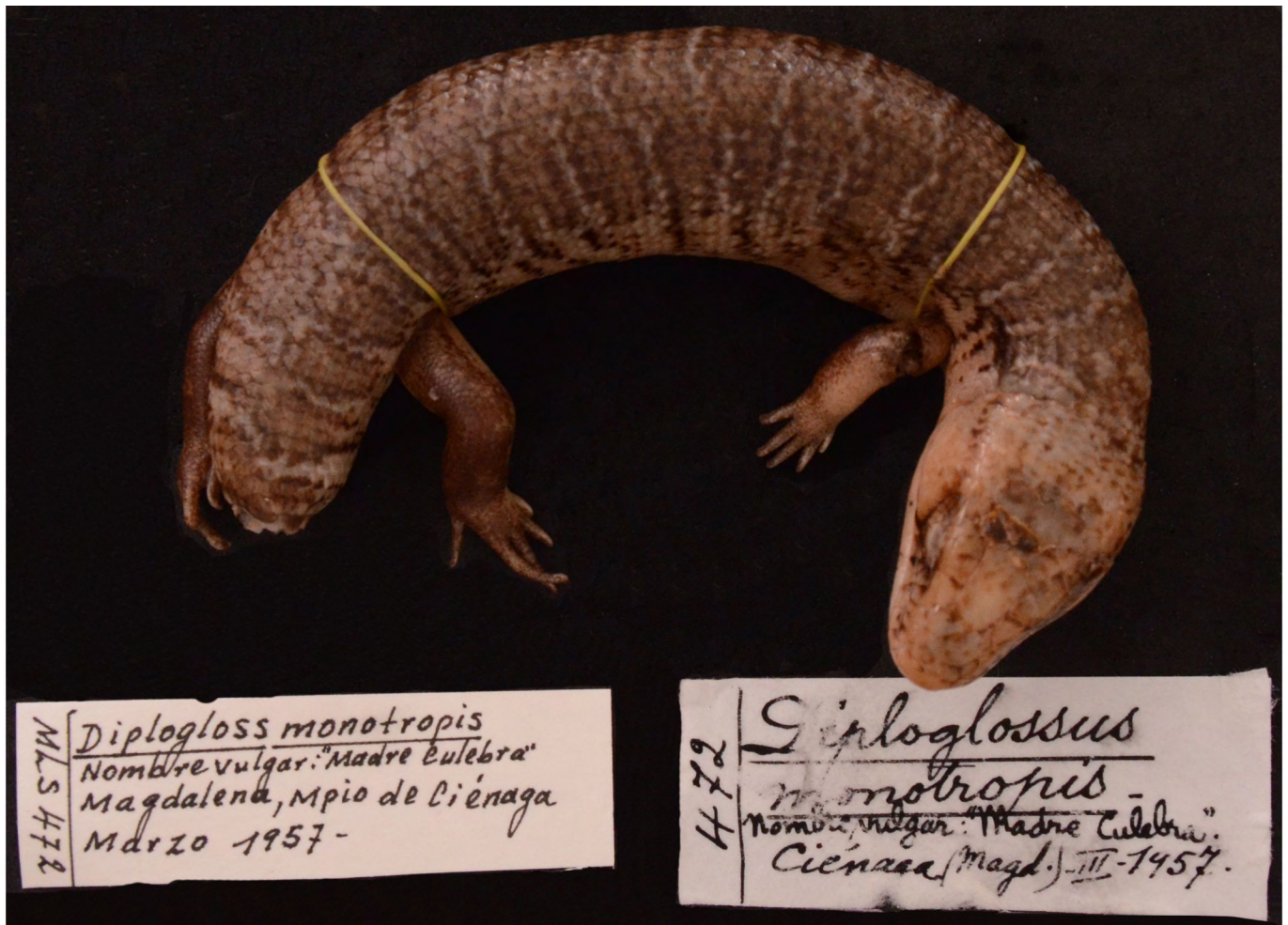
Figure 2. Dorsal view of Diploglossus monotropis (MLS-sau 472) from Ciénaga, Magdalena, Colombia.

taxon. The museum acronyms of the reviewed Colombian natural history collections are as follows: CZUT (Colección Zoológica Universidad del Tolima, Ibagué, Tolima); ICN (Instituto de Ciencias Naturales, Universidad Nacional de Colombia, Bogotá, Cundinamarca); IAvH (Instituto Alexander von Humboldt, Villa de Leyva, Boyacá); MHN-UCa (Museo de Historia Natural Universidad de Caldas, Manizales, Caldas); MHUA (Museo de Herpetología Universidad de Antioquia, Medellín, Antioquia); MLS (Museo de La Salle, Universidad de la Salle, Bogotá, Cundinamarca); and UIS (Colección de Herpetología Universidad Industrial de Santander, Bucaramanga, Santander).