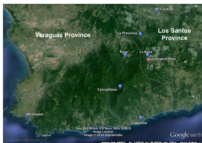
Figure 2. Map showing specific locations visited during the five expeditions described in the text.

where the team worked for three days. On 20 February, GRA ascended to a nearby peak at 1,380 m a.s.l. on foot. Trip dates: 16–22 February 1996.