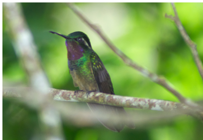
Figure 3. Photograph of male Lampornis sp. nov. STRIBC 3592 just prior to collection above La Bajía in 2011.

Glow-throated Hummingbird ( Selasphorus ardens Salvin, 1870). The potential occurrence of a hummingbird of the genus Selasphorus in the Cerro Hoya region