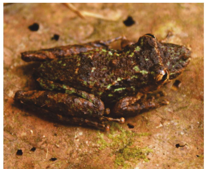
FIGURE 1. Adult male of Scinax garbei from the municipality of Serra do Navio, Amapá state, Brazil.

During fieldwork on July 25 th 2012, at 21:30h, in Parque Natural Municipal do Cancão (0.911833° N, 52.002056° W, datum: WGS84), municipality of Serra do Navio, state of Amapá, males of Scinax garbei were found calling under the marginal vegetation of ponds. The Parque Natural Municipal do Cancão was created in 2007 and has an area of 370.26 ha of Amazon forest. The locality presents transitional vegetation between the Cerrado and Amazonian Domains with permanent and temporary ponds during the rainy season that extends from February to June (Drumond et al. 2008). At the same pond the following species were calling: Dendropsophus leucophyllatus (Beireis, 1783), Hypsiboas cinerascens (Spix, 1824), H. multifasciatus (Gunther, 1859"1858"), Phyllomedusa hypochondrialis (Daudin, 1800) and Scinax nebulosus (Spix, 1824).