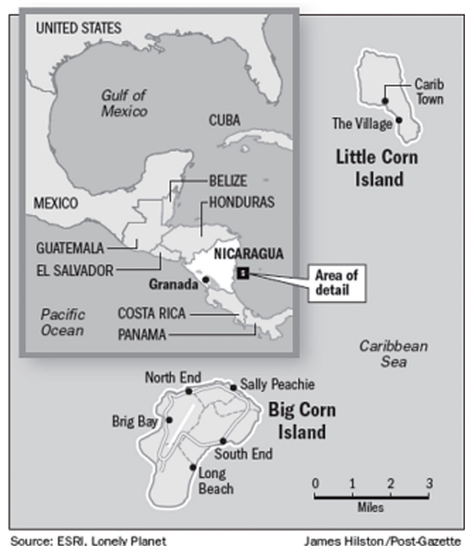
FIGURE 1. Map to the Corn Islands.

The sampled lizard fauna of the Corn Islands consists of 14 species belonging to nine families (Table 1), one of which, Gekkonidae, includes two introduced species in the islands. We recorded three species (one third of the lizard species we collected) that were previously undocumented