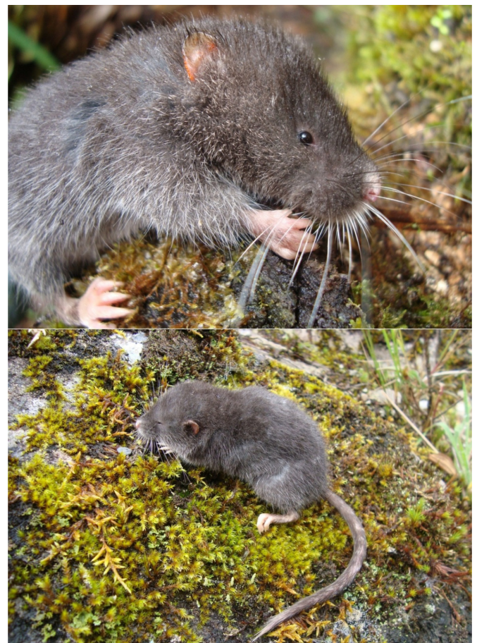
FIGURE 1. An adult male of Neusticomys monticolus (UV-13704) from Termales de San Juan, municipality of Puracé, Cauca, Colombia.

76°4'17” W, 3558 m), municipality of Florida, western slope of the Cordillera Central, department of Valle del Cauca (UV-11249). Another adult male was collected on 13 June 2010 in Termales de San Juan, Puracé National Natural Park (PNN), (2°20'37”N, 76°18'29”W, 3300 m), municipality of Puracé, department of Cauca (UV-13704) (Figure 1). Both specimens were collected with a middle