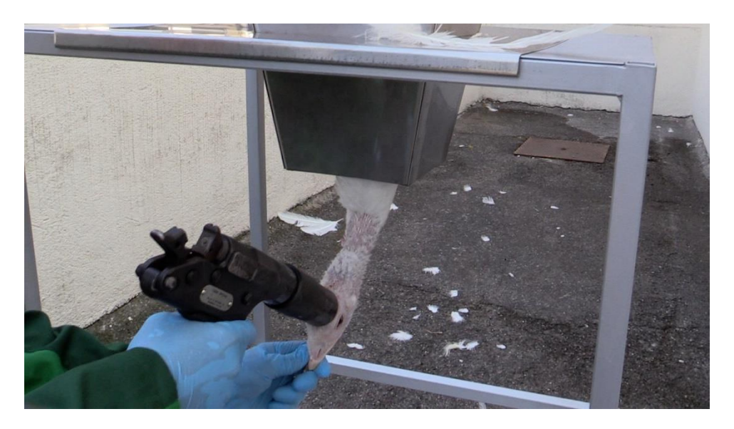
Figure 6. A cone used to restrain a turkey, the beak should be hold when applying the captive bolt.

When using a cone , first ensure that the cone is the right size for the bird. The turkey should be placed inside the cone in head-down to contain wing flapping. As this process involves inversion, the animals can experiment pain and fear (EFSA, 2019). For this reason, the stockperson should always be ready to slaughter the bird immediately after restraining it. It's very important that the time for which birds are restrained in a cone prior to stunning should be as short as possible. It is a good idea to maintain hand contact with the bird head for the first few seconds it is in the cone as this will help calm the animal.