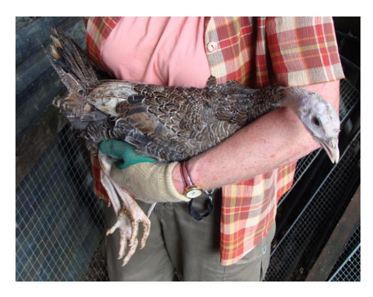
Figure 5. Manual handling of a small turkey.

Small or young turkeys may be lifted using the same method as for chickens. That is picking up the animal by placing both hands securely over the wings to prevent flapping. Once the bird is held, one hand should be slid under the body and firmly clenched the legs between your outstretched fingers (positioning one or two fingers between the legs) and support the bird's breast on the palm of the same hand. The wings can then be controlled by the opposite hand or by holding the bird against stockpersons' body, under their arm (figure 5).