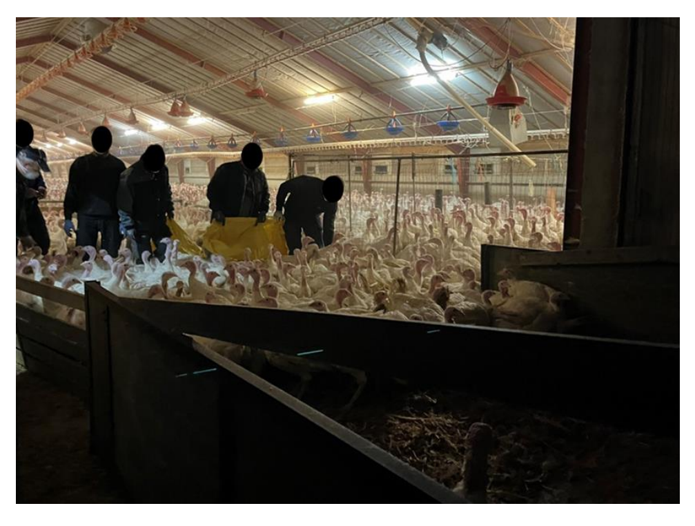
Figure 2. Flag use in turkey corralling

European Union Reference Centre for Poultry and other small farmed animal