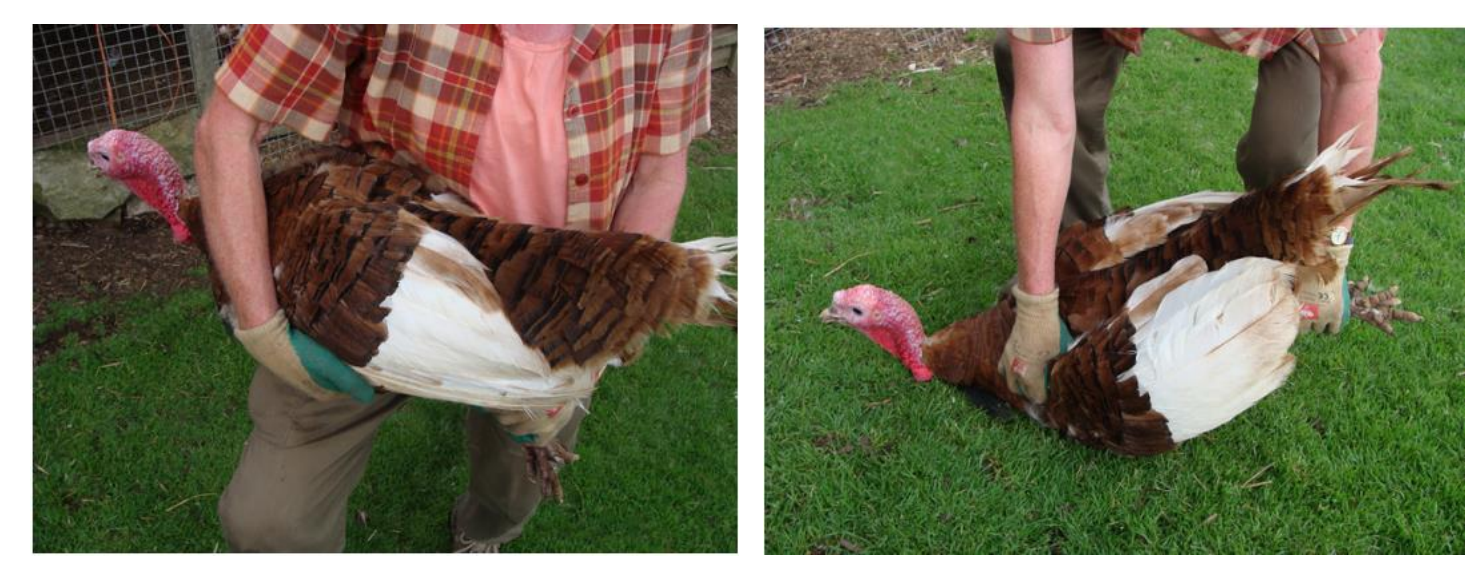
Figure 4. Manual handling and restrain a turkey. (Credit to: HSA Practical Slaughter of Poultry, 2021)

To avoid having to lift heavy turkeys for stunning, they may be manually restrained on the ground by taking hold of the legs in one hand and gently lowering the bird onto its breast (figure 4).