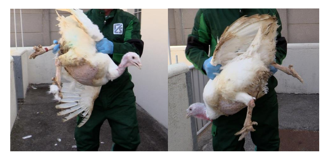
Figure3. Manual handling and restrain a turkey.

Turkeys are very strong birds with powerful legs and wings. As the HSA recommends (HSA Practical Slaughter of Poultry, 2021), to handle a turkey, the stockperson should reach from behind with one hand and take secure hold around both legs, gently lower the bird onto its breast, then slide their free arm over the wings and under the body. Later, the stockperson should lift the bird to his/her body. The stockperson can then transfer both legs into his/her other hand and use his/her free hand to control the wings.