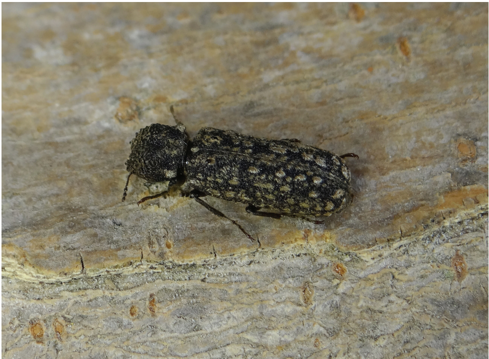
Figure 1. Adult of Lichenophanes varius from the Nature Reserve Bosco della Fontana (Italy) (photo by G. Scaglioni, 2014).

The systematics and nomenclature of plants and fungi follow, respectively, The Plant List (2013) and Index Fungorum (2017); families and, within each family, species are listed alphabetically.