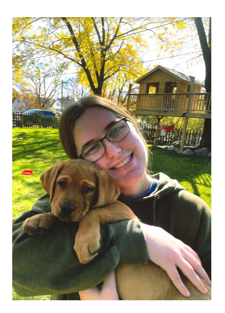
Figure 2: Post-treatment photograph of the patient.