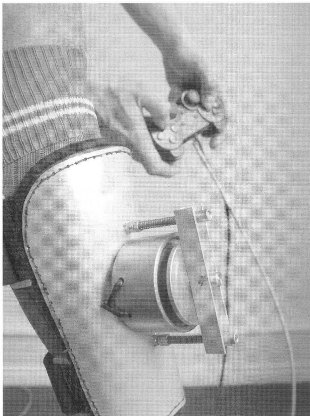
Fig. 4. Legshocker, detail view of the device. A metallic button is hammered on the shin of a player being fouled.