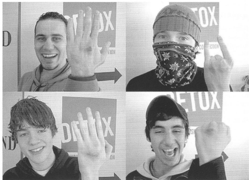
Fig. 3. Hardcore players show off their wounds after playing PainStation , DETOX Festival, Kirkenes, Norway, 2004.

Randy Sarafan presented Tazer Tag (2005) [5] as his thesis project in the Design and Technology Department of the Parsons School of Design. This is a multiplayer game in which pain and the physical space are the main coordinates. Each participant wears a headband, connected to an armband that is equipped with electrodes and a locating device. Once they are within 30 feet of each other, by pressing a button in their headband, they can send a signal that will cause the other players to receive an electroshock on the arm of between 80 and 120 volts (Fig. 5). The intensity varies according to the distance between the players: the closer they are, the stronger the pain. Thus the only way to reduce or avoid this unpleasant sensation is to run away. As any participant can shock the others, players can decide to approach each other and test their ability to withstand the pain. The purpose of the game is to endure the attacks of others and to control the surrounding space, so that no other player dares to get close. No points are scored and no screens are necessary: There is no virtual world to refer to in this case, the actual location being the ground for a fight that is only understood and experienced by the players.