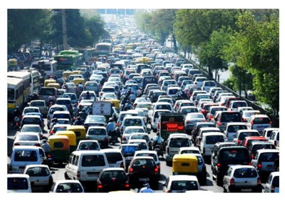
Image 6 : showing the Traffic jam condition in India

Traffic jam is one biggest problem due to road congestions, which tempt people to break traffic rules to escape the situation. This situation can be dangerous and often causing accidents. The other problem also occur like wastage of fuel, parking problem, air and noise pollution etc.