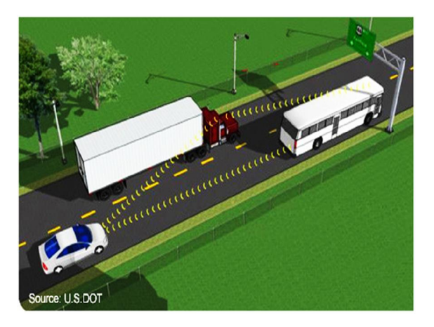
Image 7: showing the V2V communication between vehicles

braking, and loss of stability. This technology will help to warn driver about potential accidents and prevent crashes. This technology uses dedicated short-range communications (DSRC). This system will use a frequency of 5.9GHz, which is used by WiFi. The range is up to 300 meters or 1000 feet or about 10 seconds at highway speeds. V2V would be a mesh network, meaning every node (car, smart traffic signal, etc.) could send, capture and retransmit signals [10].