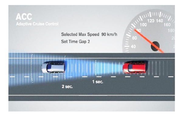
Image 2: showing the Adaptive cruise control continually adjusts the gap between vehicles based on your speed to ensure sufficient time to react.

Most of the automobile industries uses the LASER and RADAR system and mounted to the front of the self drive vehicle. It can be used to measure the gap between two vehicles. This data can be used to adjust the speed automatically between two vehicles.