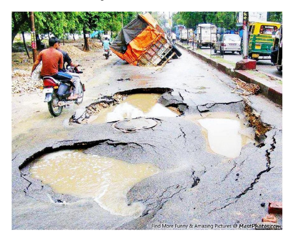
Image 5 : showing the Indian road condition in rainy season

Indian road condition is very critical and unsuitable for automatic vehicles. Many problems are in specially in rainy session by heavy rain road are fully full by the rain water and create holes on the road vehicles are trip and faces undesirable problems. Some rough roads are in village. In those conditions automatic car are not run properly and flat cars are not suitable for these roads. Because of very few height of car base to road that easily touch the road and fixed in the hole and damage the part of car. That's why in India only some expensive car are run on road and uses big size of vehicles are mostly use in India like bolero camper, Jip Truck ,Bus ,Taxi , Dustor car etc. Out of India mostly automatic cars are used and all type of vehicles are work on road. There is no holes and critical condition of road but in India road conditions are so unpredictable.