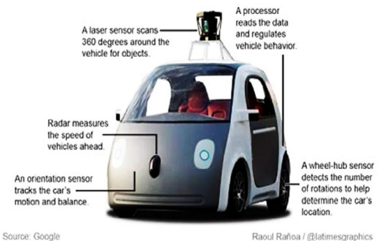
Raoul Rañoa / @latimesgraphics

The cost of LiDAR is very expensive. A single top-of-therange LiDAR costs more than $75,000, according to Waymo. Because in "Waymo" the equipment and technologies are so expensive, it's the reason that this car is too expensive for the individual customer.