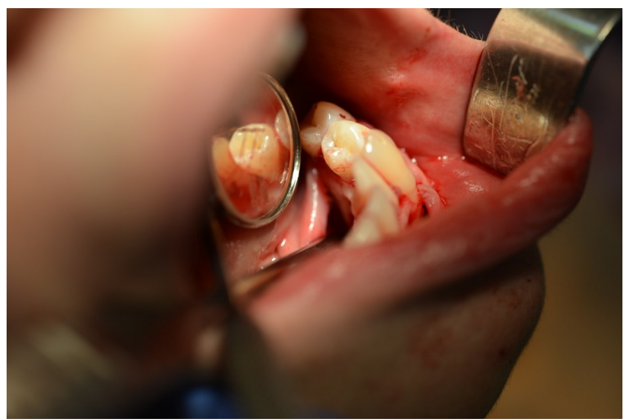
Fig.2. Mucoperiosteal flap, palatal view.