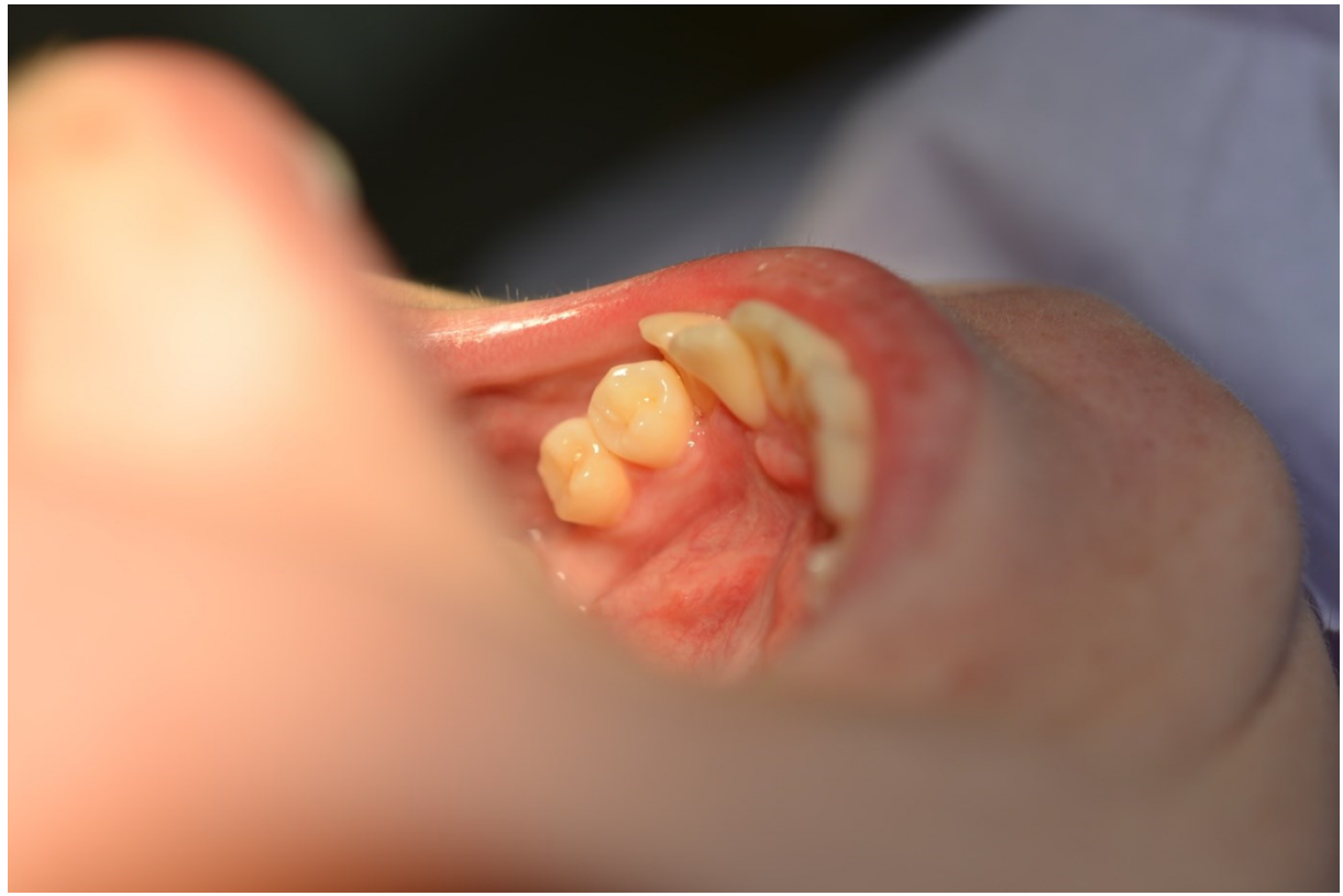
Fig. 5. Completely healed wound.