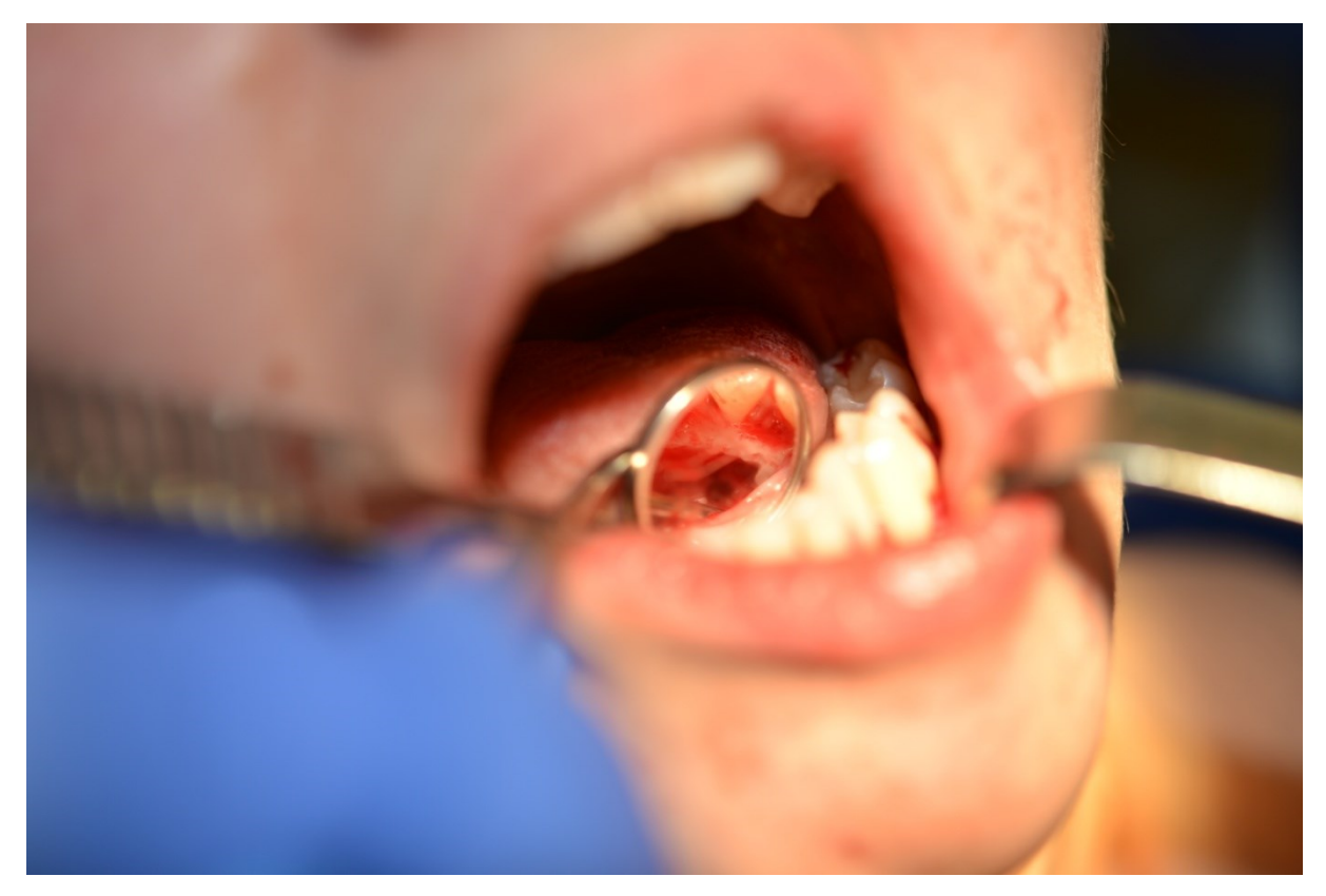
Fig. 3. Tumour bed.