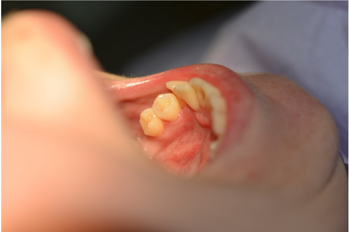
Fig. 5. Completely healed wound.