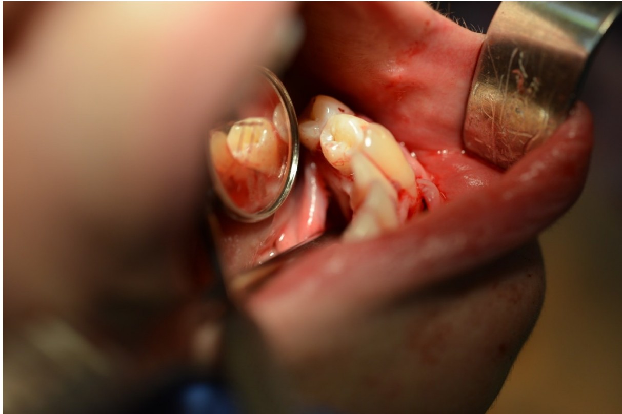
Fig.2. Mucoperiosteal flap, palatal view.