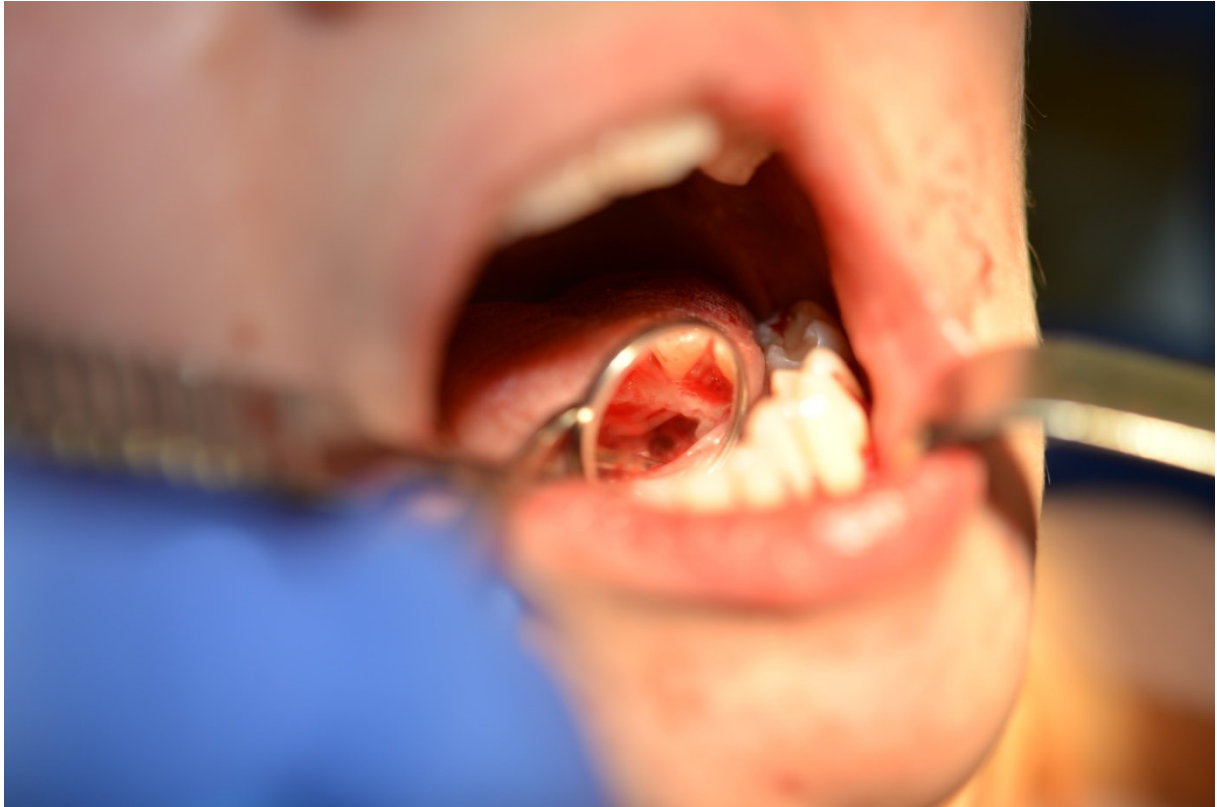
Fig. 3. Tumour bed.