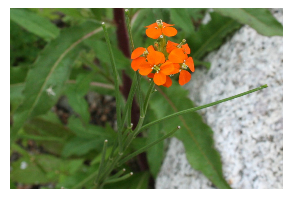
Fig. 1. Erysimum croceum inflorescence.

Alatau using botanical and molecular genetic methods" funded by the Committee on Science of the Ministry of Education and Science of the Republic of Kazakhstan.