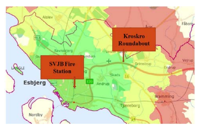
Fig. 1 Esbjerg Fires Station Response Time [8]

According to the fire station responsible for Esbjerg emergency services, Sydvestjysk Brandvæsen (SVJB), the Korskro roundabout on the outskirts of Esbjerg, a town located on western coast of Denmark, is prone to frequent traffic accidents. On average, 5-7 accidents per year are recorded on this roundabout. This paper analyzed the use of RED at a hypothetical traffic accident at Korskro roundabout. Response time is a critical factor in saving lives and FARS tries their best to reach the scene of accident in the fastest time possible. The response time from the Esbjerg fire station and the outskirts of the town is depicted in Fig. 1. The green area in Fig. 1 shows a response time of 10 minutes, while the yellow area represents 15 minutes of response time. According to the figure, the accident site of Korskro roundabout is in the green area and has a minimum response time of 10 minutes.