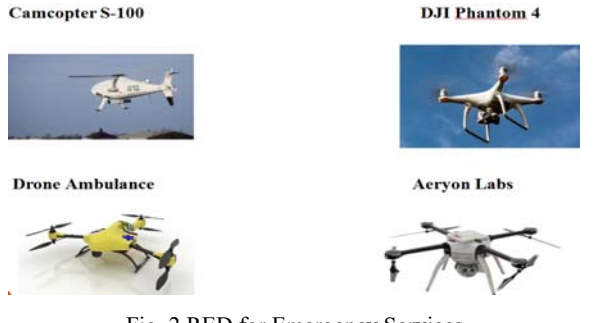
Fig. 2 RED for Emergency Services

Camcopter S-100 and Aeryon Lab's SkyRanger are two RED that are being used for search and rescue services [11], [12], while the DJI phantom-4 is used and tested by the European Emergency Number Association (EENA) for its search and rescue operations [13]. Ambulance Drone however is a prototype built and tested by Alec Momont of Delft University [3].